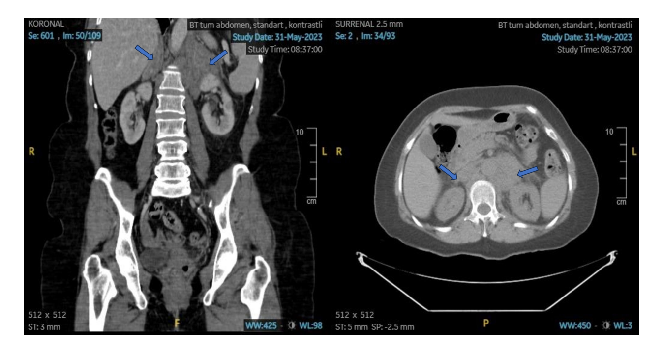
Figure 1. Coronal and axial contrast-enhanced abdominal CT sections showed suprarenal lesions (blue arrow) on the left. The largest was 10x4 cm, causing adrenal gland thickening and a prominent soft tissue lesion surrounding the glands.

in the suprarenal region. She was hemodynamically stable on admission, and her physical examination was unremarkable except for bilateral costovertebral tenderness. She had no palpable lymphadenopathy or splenomegaly. Her initial basic laboratory tests were unremarkable except for anaemia of the chronic disease, mild thrombocytopenia (131 × 103/μL) and hyponatremia (126 mEg/L). ACTH and cortisol tests sent initially for adrenal insufficiency evaluation were within normal range. Hyponatremia was consistent with a syndrome of inappropriate antidiuretic hormone secretion (SIADH). Elevated levels of beta-2 microglobulin (3,043 ng/mL) and LDH (512 U/L) were found in laboratory tests. A CT scan with adrenal protocol revealed suprarenal lesions, with the largest measuring 10x4 cm on the left, causing adrenal gland thickening and a prominent soft tissue mass surrounding the glands (Figure 1). A tumour F-18 fluorodeoxyglucose (FDG) positron emission tomography (PET) demonstrated intensive FDG uptake in the supraclavicular-mediastinal-abdominal-mesenteric lymph nodes and bilateral adrenal masses (Figure 2). The greatest dimension was 14 cm in the left adrenal mass, and the maximum standardised uptake value (SUVmax) was 26.1 (relative to the mean SUV in the normal liver parenchyma, which was 2). Before the left adrenal gland biopsy, in the 24-hour urine, metanephrine and normetanephrine levels were measured to exclude pheochromocytoma, which was