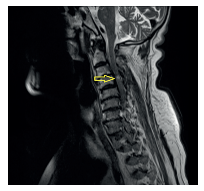
Figure 1: Spinal cord concussion is seen at the location indicated by the arrow.

was available. In the central part of the spinal cord at the level of C4, a 5.8 mm myelomalacic region, hypointense in the T1A series and hyperintense in the T2A series, was observed and this image was interpreted in favor of spinal concussion (Figure 1-2). According to the clinical presentation and MRI results, the patient was diagnosed as SCIWORA. The patient, who was consulted by neurosurgery, was recommended follow-up in intensive care. The patient was followed up in the intensive care unit for 15 days. The patient, whose neurological deficit improved, was discharged.