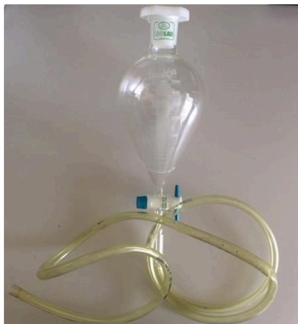
Figure 3. Graduated glass funnel