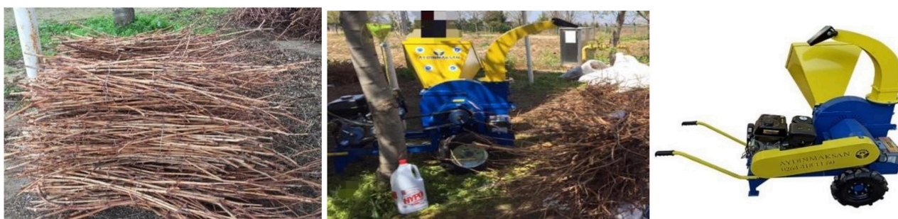
Figure 1. Branch shredding machine used in trials

Vine branches of Boğazkere (wine), Öküzgözü (wine) and Şire (table) ( Vitis vinifera L.) grape cultivars belonging to the region were used as plant material in the study. Pruning branches were obtained from the vineyards of the grape producers in Diyarbakır. The pruned branches were turned into bundles in the vineyard. It was transported to Dicle University Faculty of Agriculture, Department of Agricultural Machinery and Technology Engineering to be tested later, and was kept under a covered porch. In the shredding of the vineyard pruning wastes, a branch shredder machine manufactured by a private company, which has a 15 HP powerful, 4-stroke gasoline engine (starter-battery powered), the chimney system can rotate 360°, is both fixed and capable of moving in the vineyard by one person is used. There are three chopper blades on the machine. The blades are driven by three replications gasoline engine with the a belt and pulley system (Figure 1).