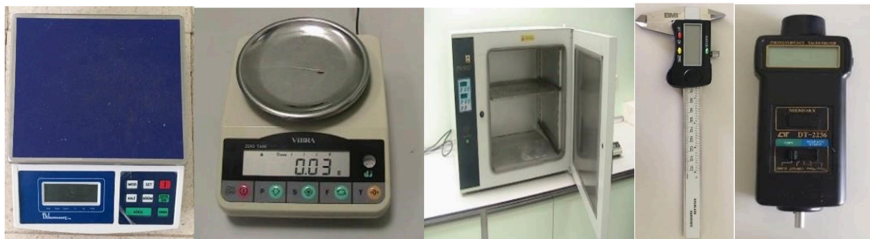
Figure 2. Balances, drying cabinet (oven), caliper and speed measuring device

contents of pruning branches were measured as 38.10% for Boğazkere cultivar, 38.80% for Öküzgözü cultivar and 38.30% for Şire cultivar.