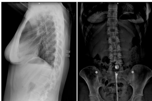
Figure 3a-3b. Patient's lateral lung and direct abdomen radiographies.