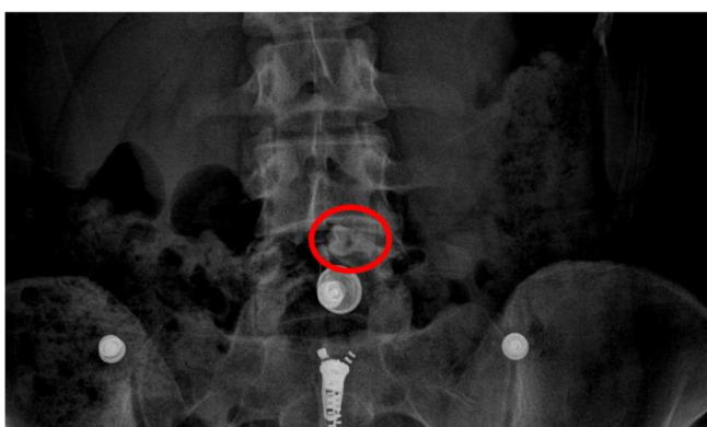
Figure 4. The tooth which seen on patient's direct abdomen radiography.