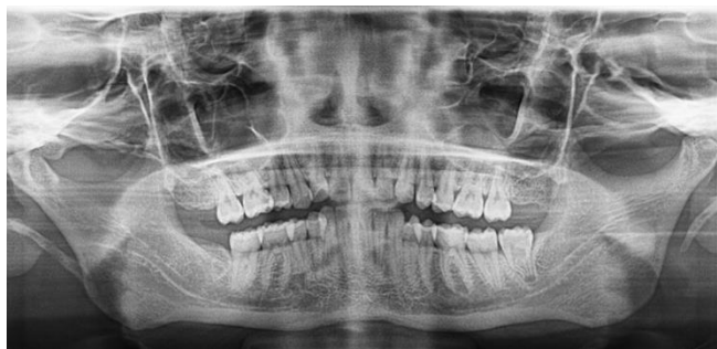
Figure 1. Patient's panoramic radiography.

Extraction of the tooth for the treatment was recommended to the patient. Detailed information about the procedure was given and all possible risks were explained. After that, the patient's written consent was obtained, and the extraction of the tooth was started. The flap was removed after local anesthesia. The tooth was fully raised with the elevator. It was observed that the patient developed a nausea reflex while holding the tooth with extraction forceps, and then the tooth was not in place.