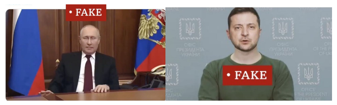
Figure 14. Russian President Deepfake on the left, Ukrainian President Deepfake on the right

In the context of the political tensions between Russia and Ukraine in 2022, a deepfake video purporting to show Russian President Vladimir Putin declaring peace was disseminated on Twitter, a prominent social media platform (Wakefield, 2022).