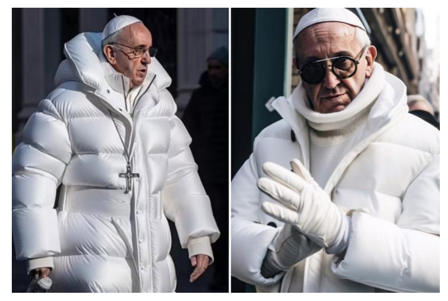
Figure 10. Balenciaga Ad is Papa's Deepfake

The audience was taken aback by the unconventional aesthetic of the 86-year-old religious leader, Papa Francis, who was attired in a Balenciaga ensemble. Balenciaga disseminated a digitally manipulated image, commonly referred to as a deepfake, depicting the Papa adorned in a lengthy white puffer jacket, via the internet. This image swiftly proliferated across various online platforms (Figure 10).