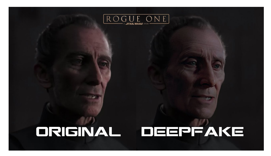
Figure 11. Peter Cushing's Deepfake

The utilization of deepfake technology in the film industry has the potential to enhance the realism and captivation of movies. Prior to the advent of this technological advancement, the production of lifelike fabricated videos was still feasible within the realm of visual effects studios or through the utilization of computer graphics in the film industry. However, it is worth noting that this approach incurred higher expenses (Dickson, 2018).