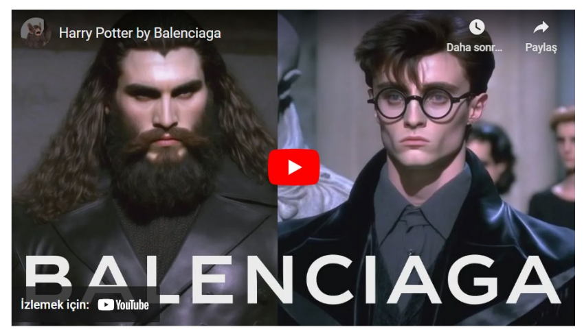
Figure 9. Balenciaga Youtube Ad

extensive recognition of the Harry Potter film franchise to creatively promote its brand. According to Jennings (2023), Balenciaga has the potential to generate substantial revenue by leveraging Youtube ads).