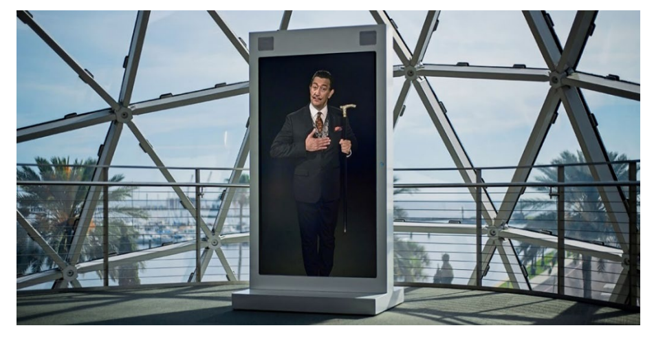
Figure 1. Kiosk Area where Dali Welcomes Visitors

For instance, St. A deepfake representation of Salvador Dali was generated at the Dali Museum in St. Petersburg, Florida, with the purpose of welcoming visitors and narrating anecdotes pertaining to his biography (Lee, 2019). The integration of artificial intelligence and deep learning techniques facilitated the combination of archival footage belonging to Dalí with recently captured footage executed by a professional stuntman. The outcome yields a verisimilar avatar that bears no discernible differences from the authentic representation of Dalí (Figure 1). The deepfake technology was incorporated into the museum setting as an integral component of the interactive exhibition titled "Dali Lives".