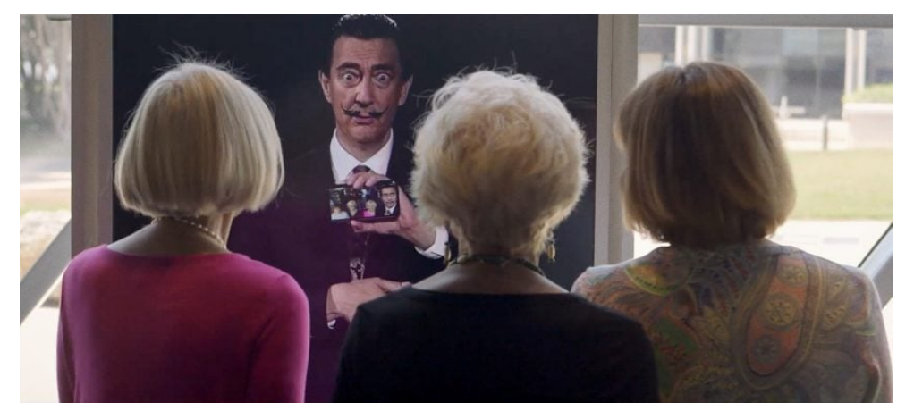
Şekil 2. A Snapshot of Dali Taking a Selfie with Visitors

and correspond through electronic messages (Figure 2). Furthermore, due to its programming incorporating a vast array of word and phrase combinations, Deepfake offers a unique encounter to each individual visitor (Isabelle, 2019). According to Kwok and Koh (2021), the utilization of advanced deepfake techniques, which involve the integration of high-resolution image blending, has the potential to significantly alter the visitor's encounter, thereby introducing a novel aspect to personalized service (p. 1799).