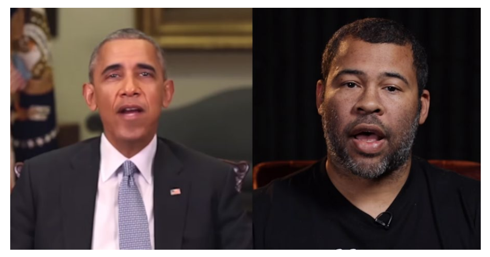
Figure 13. Obama's Deepfake on the left, Jordan Peele Imitating Obama on the right

According to Aviv Ovadya, a technologist who accurately forecasted the proliferation of misinformation during the 2016 elections, advancements in technology have enabled users to manipulate audio or video content to create a convincing illusion of authenticity (Mack, 2018). There are still observable instances that serve as examples in the present day.