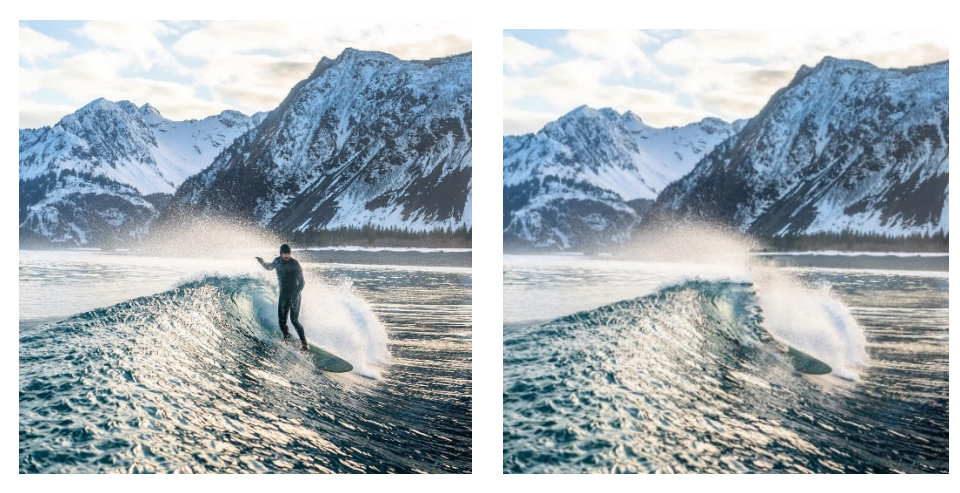
Figure 5. First and Last Image Example from Deep Angel Application

Photography applications also employ deep learning techniques. The application known as "Deep Angel," developed by the MIT Media Lab, is a deepfake tool that utilizes artificial intelligence and media manipulation techniques. This application is designed to identify and remove objects from photographs without requiring explicit user input (MITMediaLab, 2020) (Figure 5).