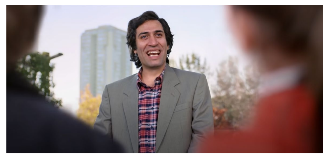
Figure 7. Ziraat Bank Ad Kemal Sunal's Deepfake

Çeber (2023), there is a belief that the effective communication of the alignment between a brand and a celebrity to the audience is insufficiently achieved (p. 24).