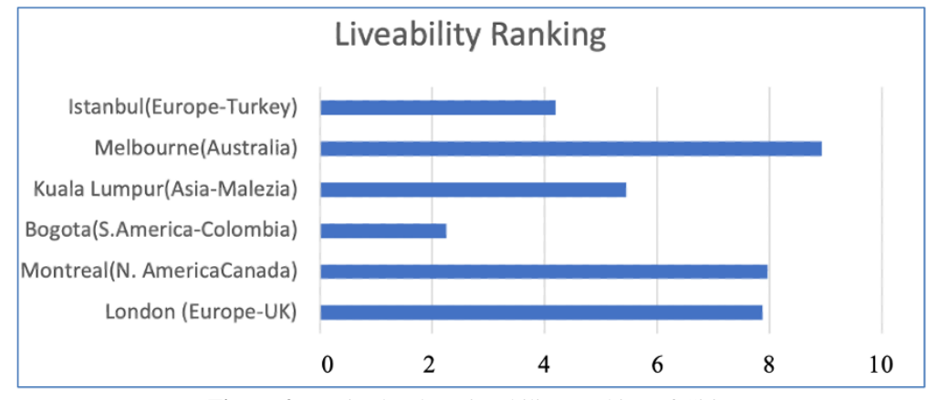
Figure 2. Revised Index Liveability Ranking of Cities

When comparing cities, normalization was arranged to rank them between values 1-10. In Figure 2, among the cities compared, Melbourne had the highest liveability index with a score of 8.93. It is followed by Montreal with 7.96, London with 7.87, Kuala Lumpur with 5.45, Istanbul with 4.19, and Bogota with 2.25. These rankings give a general idea about the liveability of these cities with the revised index.