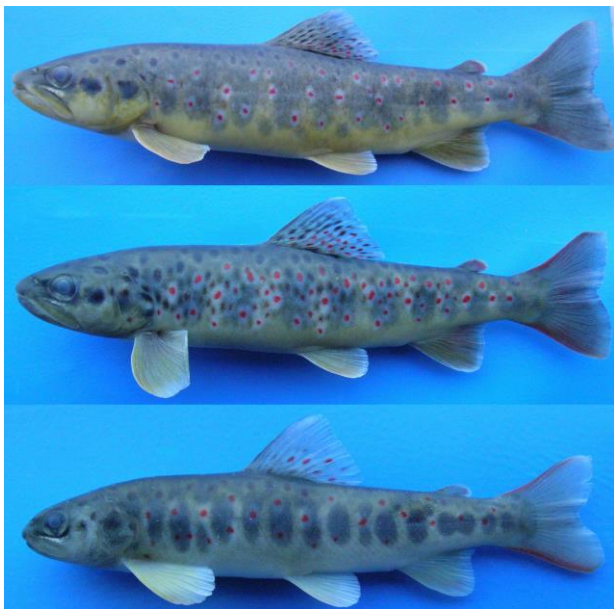
Figure 1. Salmo duhani , from top: FFR 3183, holotype, 228 mm SL, male; FFR 03184, paratypes, 160 mm SL, female, and 92 mm SL, juvenile; Turkey: stream Zeytinli.

http://zoobank.org/um:lsid:zoobank.org:act:C050C743-3FE3-40AD-9A65-DF97DB09FFD8