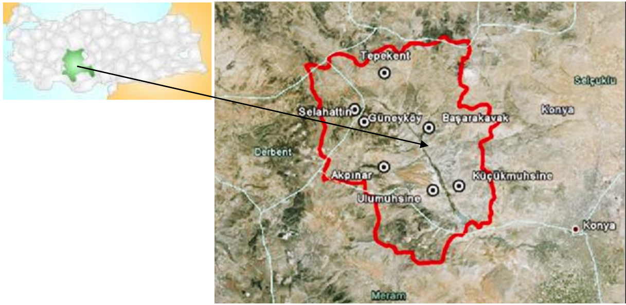
Figure1. Study area

The selected research area, located within the boundaries of Konya province in the Central Anatolia Region of Turkey, is situated approximately 13 km northwest of the city center along the Konya-Beyşehir road, between the 37° 50' and 38° 07' north parallels and the 32° 05' and 32° 21' east meridians. The Altınapa Dam Lake Basin, which extends in a northwest-southeast direction, encompasses the districts of Meram, Selçuklu, and Derbent within Konya province, as well as the towns of Tepeköy and Başarakavak, along with local administrative areas such as Küçükmuhsine, Ulumuhsine, Güneyköy, Akpınar, Dağdere, Mülayim, and Selahattin villages (Figure 1).