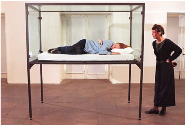
Image 6. Actress Tilda Swinton Sleeps in a Glass Box at the Serpentine Gallery in London As Part of Cornelia Parker's Film The Maybe, 1995 (Swinton, 1995)

Another artist using the female body as a performance material is Ana Mendieta. The Cuban artist is famous for her subtle but powerful interventions against nature. However, she has performed many performances questioning the concepts of female beauty by addressing feminine issues such as violence and oppression against women. In 1972, in response to the murder of a young girl who was raped, she performed "Glass on Body Imprints" by soaking her body in animal blood against a glass partition in her performance with her body. She recreated the victim's poses in front of the audience (Image 7).