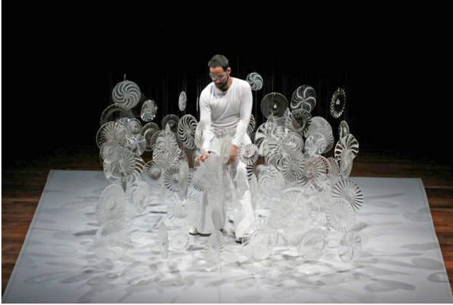
Image 2. Elaine Miles, "Reflections," Glass Percussion Project, 2019, 300 × 300 × 150 cm (Miles, 2019)

to create a narrative language in performance art, is especially seen in international performances. An example of this is Elaine Miles' Glass Percussion performance using approximately 1000 shaped glass objects, sound and light. With this study, it is aimed to contribute to music with an experimental and contemporary approach. An Australian contemporary artist working in the fields of installation, sculpture, and performance, Miles uses glass predominantly in her performances (Image 2).