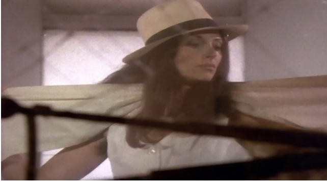
Image 8. Hannah Wilke, Through the Great Glass , 1976 (Wilke, 1976)

incorporated bulletproof features into the glasses she uses in her performances. The artist's research on new techniques and new ways of using glass materials have formed the art attitude of today. As a performance and glass artist, she consistently crosses boundaries in her narratives of interaction between objects and actors. An example is the recurring cloak seen in Chorus of One (2016–2018) and Noon (2016–2019). The cloak is made of Rhino glass, a special glass developed for the army to be bulletproof and unbreakable (Image 10).