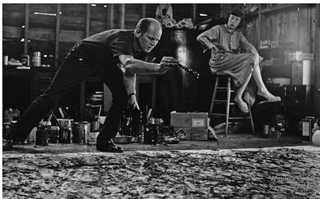
Image 1. An Image From Jackson Pollock's Work and His Working , 1950 (Paftal, 2019)

movements. The movements made by the artist in the process of creating his works constitute the work itself (Image 1).