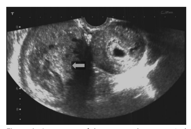
Figure 1: Appearance of the mass on the transvaginal ultrasound.

A semisolid heterogeneous mass lesion with a size of 105x77 mm and originating from the right lateral of the uterus was detected by transvaginal ultrasonography (Figure 1). The laboratory tests showed her \beta -hCG (56 U/L) level to be high, the tumor marker values to be normal, and leukocytes to be 11.100/ \mu L. The patient presented only with pain in the right lower quadrant of the abdomen in her physical examination and was operated on by gynecologists with prediagnoses of uterine myoma and cyst originating from the right ovary.