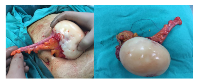
Figure 2: Dermoid cyst of the cecum.

Regression was observed in the patient's complaints during the postoperative period, and she was discharged on the 7<sup>th</sup> postoperative day. No recurrence was observed during the patient's follow-up one year later.