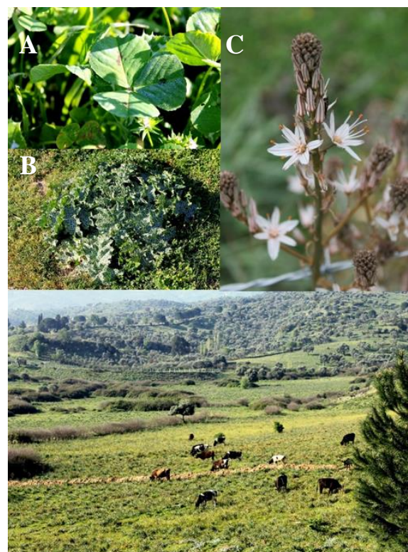
Figure 1. Çakmar rangelands (A: Medicago arabica ; B: Silybum marianum ; C: Asphodelus sp.)

The analysis of biodiversity in rangeland studies often involves the assessment of various factors such as species richness, ecosystem services, and livestock production. emphasized the importance of landscape-scale features and practices, such as hedgerows, in enhancing biodiversity and ecosystem services in agroforestry systems (Torralba et al., 2016). Similarly, utilized a model to assess the impact of livestock production on rangeland biodiversity, highlighting the significance of understanding the effects of food demand and livestock production on future biodiversity (Alkemade et al., 2012).