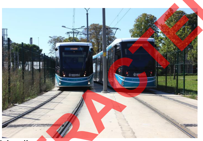
Figure 1. Akcaray light rail system

Akcaray, as an alternative solution to public transportation, started its first journey in June 2017. It carries a total of 12 low-floor two-way trams (Figure 1) and 9.1 km of Sekapark-Otogar locations, and the route of the tramline is shown in Figure 2 [17].