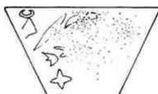
Fig. 2: The Cruciform Seal's Left Wing (Dinçol, Dinçol, Hawkins, and Wilhelm 1993: 88)

Ašmunikal 's name stands on the left wing of the obverse of the seal impression. However, the full name could not be read due to fragmentation in the document. The legible part of the seal impression is the word nikkal(u) 14 , which corresponds to the goddess name NIN.GAL 15 .