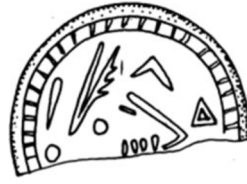
Fig. 3: Button Seal's Drawing (Dinçol and Peker 2017: Kat.5, Res.5)

In the persistent search for how the name Ašmunikal might have been written using Anatolian hieroglyphs, one might ask whether the Hurrian word ašmu- has been documented in Anatolian hieroglyphs. According to the 1981 publication, the spelling appears as A-ša-mu (wa)-(?) on a button seal 17 . The interpretations of the spelling were later revised as Ašmu- and re-evaluated 18 . According to this completed publication, the personal name is Ašmu-[Hepa] 19 , ša-mu-[ha-pa]-*a (BONUS 2 FEMINA) 20 .