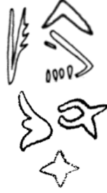
Fig. 4: Illustration of a possible arrangement of the name suggested by one of the referee that accepted by the author.

syllables sa-mu-ni-ka-lu*-a in both documents, we would like to suggest the spelling of the name Ašmunikal in Anatolian hieroglyphs 22 (see below Fig. 4).