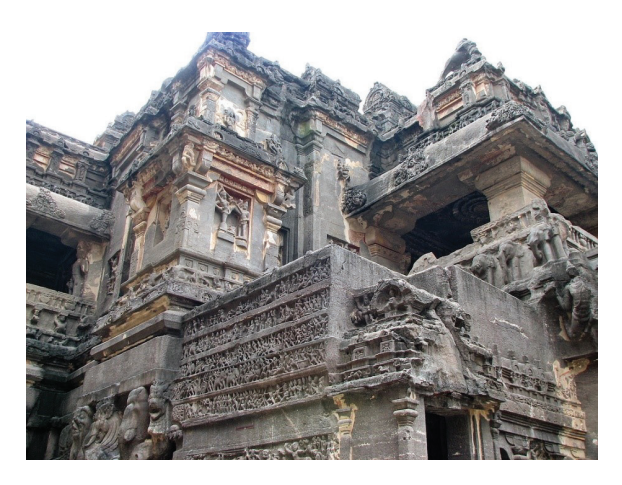
Figure 7. A view of the monuments located in Ellora that is accepted as a world heritage.

Şekil 7. Dünya mirası olarak kabul edilen Ellora kasabasında yer alan anıtsal kaya yapısından bir görüntü.