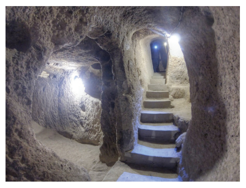
Figure 8. Kaymaklı underground city in Cappadocia. Photograph by Nevit Dilmen is distributed under a CC BY-SA 3.0 license (Wikimedia Commons-f, 2017).

Şekil 8. Kapadokya'daki Kaymaklı yer altı şehrinden bir görünüm. Fotoğraf Nevit Dilmen tarafından çekilmiş olup CC-BY-SA-3.0 ile lisanslanmıştır (Wikimedia Commons-f, 2017).