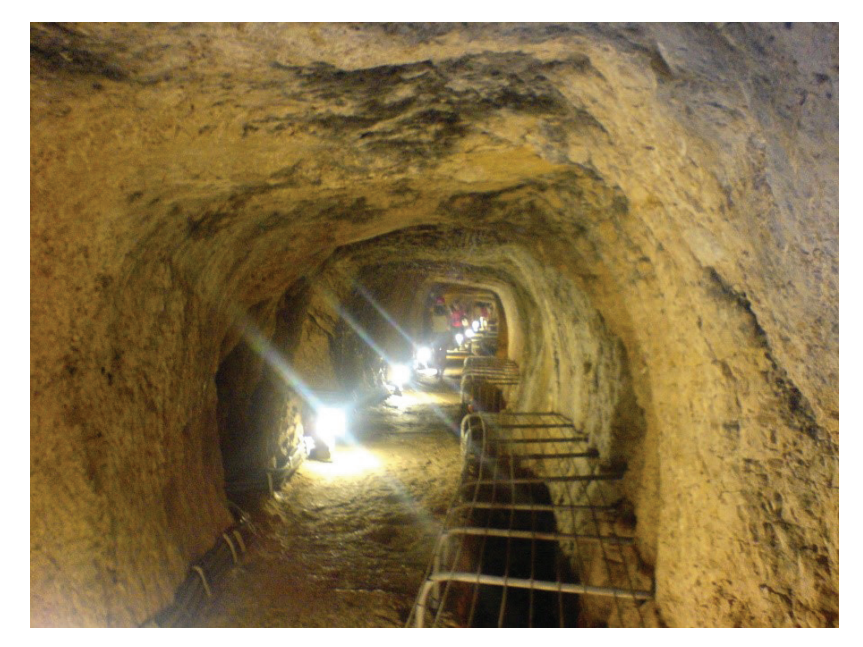
Figure 2. A general view of Eupalinos tunnel constructed in Samos Island (Wikimedia Commons-a, 2017). Sekil 2. Sisam adasında açılan Eupalinos tünelinden genel bir görünüm (Wikimedia Commons-a, 2017).

About 2700 years ago, ganats, which were special water management systems in Iran were constructed. The aim of the construction of the ganats was to supply water to settlements and arid areas for irrigation purposes. This water supply system consists of shafts and a tunnel that connects these shafts. Water, collected from water table via shafts and transferred to the tunnel, is transmitted through the tunnel by gravity. Gonabad Ghasbeh Qanat is the oldest ganat with 45 km length (Alemohommad and Gharari, 2010; Garry, 2012). Tunnels were also constructed for water supply purposes. Greek engineer Eupalinos of Megara constructed the Eupalinos tunnel (Figure 2) that was excavated from both sides, in Samos Island in 520 BC (Garry, 2012).