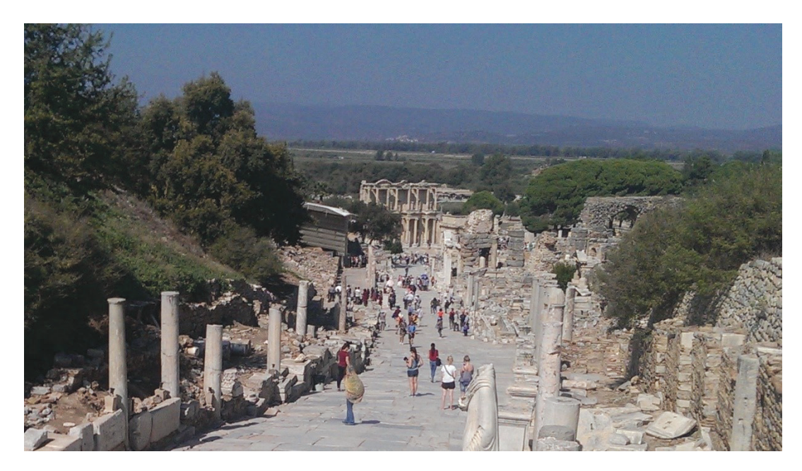
Figure 1. A view from Ephesus. Şekil 1. Efes Antik Kenti'nden görünüm.

1), Stonehenge and Pyramids were built of rock. The underground structures were constructed and used for sanctuaries, tombs or for storage of goods. Besides, depending on the mankind needs, rock tunnels were driven to transfer water to the towns or to protect the towns from floods as well as to communicate with other societies. In this review paper, some breathtaking examples of rock structures of ancient and modern times will be given and a brief explanation about the development of rock mechanics will be presented.