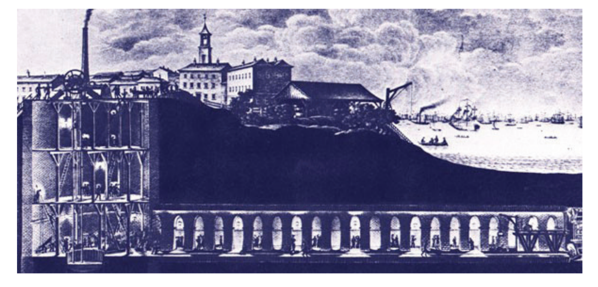
Figure 4. The Thames Tunnel. Lithograph by Taulman after Bonisch is distributed under public domain (Wikimedia Commons-b, 2017)

The use of rock structures as a part of public transportation can be mentioned as another significant progress. In 1863, the Baker Street Station, the oldest underground station, was built as a part of subway system. The Tunnel in Istanbul is known as the 2<sup>nd</sup> subway system and is followed by big cities such as Paris, Berlin, Chicago, Stockholm, Moscow, Budapest etc. (Szechy, 1973; Garry, 2012). A photograph of the Tunnel is presented in Figure 5.