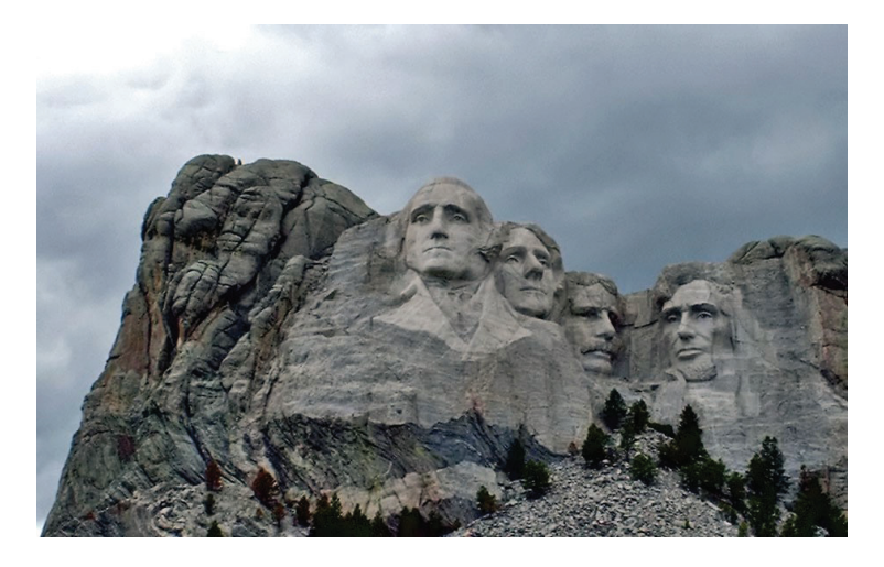
Figure 11. Mount Rushmore sculptures.

Underground for structures serve extraordinary objectives. Mount Rushmore sculptures (Figure 11), one of the amazing structures of the rock engineering, were completed in 1941 after being carved for 14 years. 18 m high sculptures of George Washington, Thomas Jefferson, Theodore Roosevelt and Abraham Lincoln were carved from granite made in the Black Hills of South Dakota (Romana et al., 2007; America's Library, 2016.). This structure may be one of the best example in which art meets rock mechanics. Before carving the sculptures, a detailed investigation was performed at site and weathered rock was removed by blasting (Goodman, 1989).