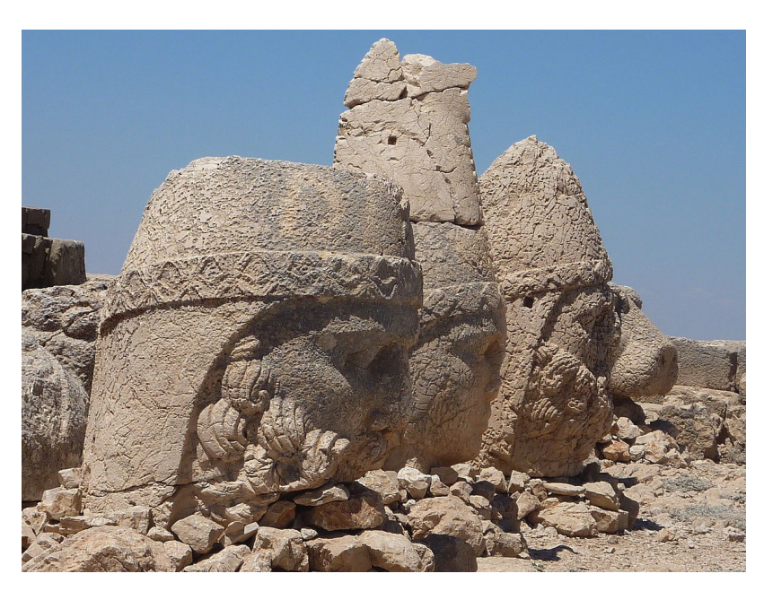
Figure 9. Head statues at Nemrut Mountain. Photograph by Urszula Ka is distributed under a CC BY-SA 3.0 license (Wikimedia Commons-g, 2017).

Şekil 9. Nemrut Dağındaki heykeller. Fotoğraf Urszula Ka tarafından çekilmiş olup CC-BY-SA-3.0 ile lisanslanmıştır (Wikimedia Commons-g, 2017).