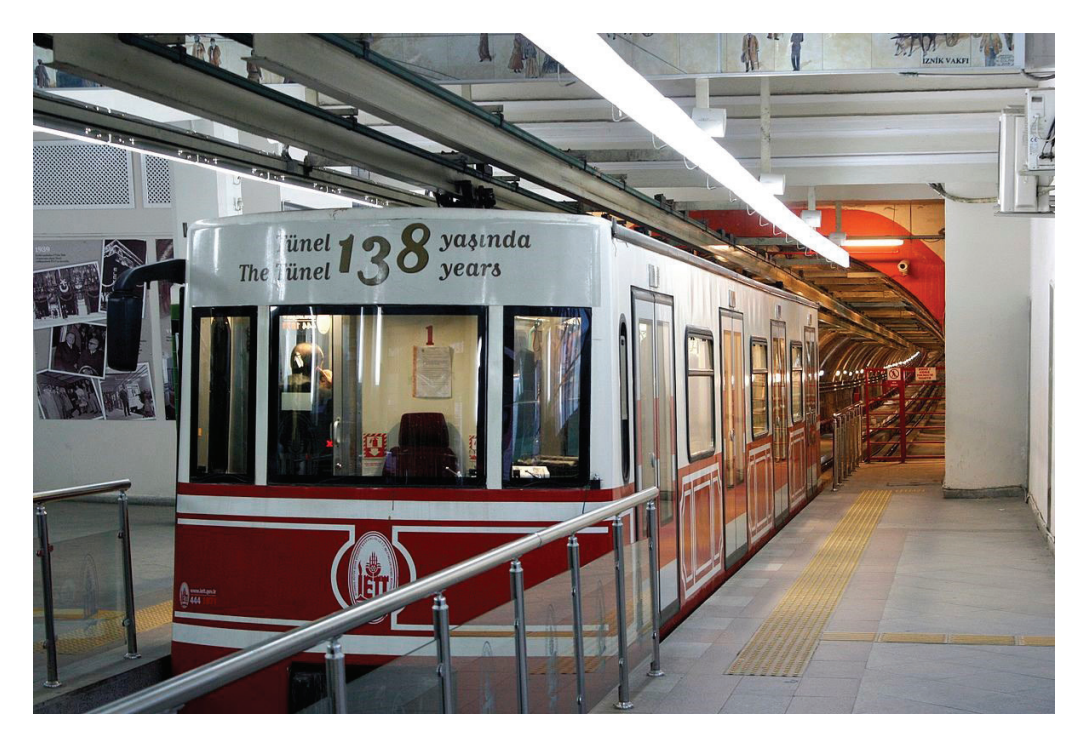
Figure 5. The Tunnel in İstanbul.

Şekil 5. İstanbul'da Karaköy - Beyoğlu arasındaki Tünel.