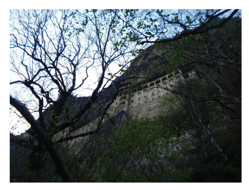
Figure 10. Sumela Monastery. Şekil 10. Sümela Manastırı.

Şekil 9. Nemrut Dağındaki heykeller.