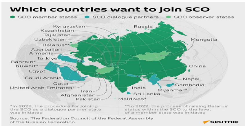
Figure 1. SCO and Growing Across Eurasia

Although it may seem like a fact of ancient times that historical experience has contributed to the rise and fall of nations and empires (Keneddy, 1989), the region still has great demographic potential. We examine the perspectives of societies on the relationship between population and power, followed by an investigation into any lessons that history may have taught us on their interconnectedness. In this case, the demographic power of the SCO should also be kept in mind. The SCO's scope covers a region that boasts unparalleled geopolitical and demographic strength. We must include this region in our considerations. Despite China and Russia being the major global players in the region, it is essential to acknowledge the position and potential of the regional actors. Historically, 13th-century roads and transit routes passed through the Eurasian and Central Asian regions encompassing a long line in the later. This line indicates that in addition to the "Silk Road" route, the Russian steppes constitute a vital trade area in terms of northern trade. In particular, the trade routes between China and Central Asia stretch from the south of the Caspian Sea to India, Iran, the Arabian Peninsula, the Black Sea and the Mediterranean.