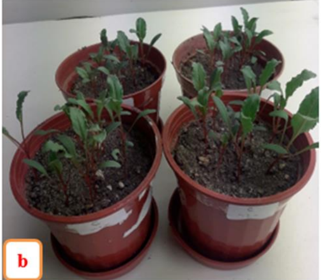
b) Appearance of seedlings as a result of pathogenicity test