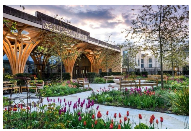
Figure 4: The Garden of the Cambridge Central Mosque

ventilated throughout the year. Photovoltaic cells on the roof help generate renewable energy from sunlight. The mosque, which is very well insulated and naturally ventilated, is heated and cooled with locally generated energy, which produces much more energy than it consumes due to high-efficiency heat pumps in the basement. This type of heat pump extracts energy from the relatively constant temperature of the air or groundwater, heating the building as needed and cooling the building during times of high occupancy or excessive heat gain (Environment, n.d.). The mosque is partially powered by solar energy, which provides all of the hot water used, cooling of the building, and 13 percent of the heating. It also collects rainwater for toilet flushing and irrigation.