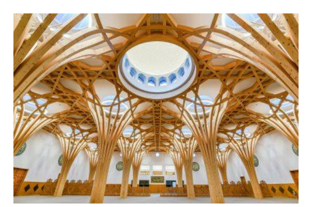
Figure 1: Timber pillars inside the Cambridge Central Mosque.

The final design was brought together by UK-based specialists to create a synthesis combining the geometry and horticultural elements of traditional Islamic architecture with indigenous English materials, plants, and craftsmanship (A British Mosque for the 21st Century, n.d.). When looking at the British religious architectural features used in the design of the Mosque, the wooden tree-like columns that form the defining feature of the Mosque reach up to support the roof in an interlaced octagonal lattice vault structure reminiscent of the English Gothic fan vault, famously used at the King's College Chapel in Cambridge.