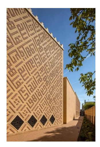
Figure 3: The exterior walls of the Cambridge Central Mosque covered with calligraphy.

Geometric art, which has an essential place in Islamic design and serves the religious purpose of showing "what is behind the visible world", is placed everywhere in the Mosque, from its structure to its decoration. The Mosque is located in the middle of a garden called the 'Islamic Garden'. After entering the garden, worshipers are first greeted by a covered portico and then an atrium and finally, they reach the prayer hall. The impression is created that the worshipers are offered a gradual transition from the outside world to the place of worship.