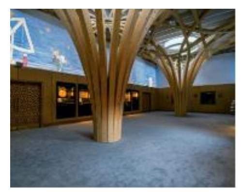
Figure 6: Soundproof rooms for kids and families

All in all, the Cambridge Central Mosque provides an alternative space for all Muslims in 21st-century Britain, alongside its Eco-friendly nature. In this case, it can be a leading example of future design in sanctuaries. The Mosque embraces multicultural aspects of the community and structural views.