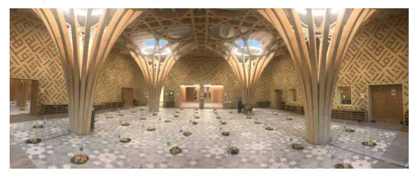
Figure 3: Iftar preparation in the Mosque

approach to the Muslim population of different nationalities, sects, and understandings, and answering the timely issues that Muslim society has been facing. The demographic of the Muslim community in the area of Cambridge is highly diverse, and the Mosque aims to provide an umbrella to all communities. For example, the Mosque has three imams from highly educated backgrounds and different nationalities and traditions: Turkish, Bosnian and American Muslim (Our Imams, 2024).