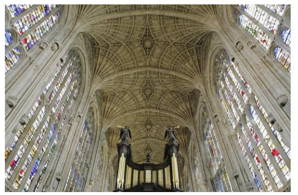
Figure 2 : The English Gothic fan vault ceiling of the King's College Chapel in Cambridge.

In terms of Islamic religious architecture, octagonal geometry, which symbolises infinity, the cycle of inhalation and exhalation – the 'Breath of the Divine' in Islamic art, was used to illuminate the interior space of the Mosque (Figure 1 and Figure 2).