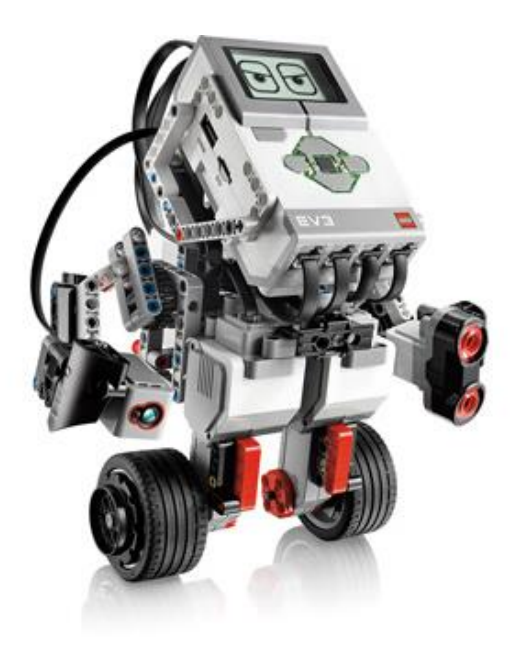
Figure 1. Lego MindStorms robot able to move on two wheels

its first programmable MindStorm robots with MIT in 1998. These first robots were called MindStorms RCX. In 2006, MindStorms NXT was developed, which was followed by MindStorms NXT 2.0 in 2009 and lastly by MindStorms EV3 in 2013 (Patterson, 2011). In the present study, the Lego MindStorms EV3 basic education set was used. In Lego MindStorms EV3 robots, there is one programmable brick. On this brick, four ports are found to connect the engines and sensors. In addition, in the basic education set, there are two big and one small engines, a color sensor, a touch sensor, gyro sensor, an infrared sensor and various plastic parts to produce simple robots. It is possible to produce a wide variety of robots by using these parts. It is necessary to develop a different programming logic for each robot produced (Koç & Böyük, 2013). Figure 1 presents a MindStorms robot designed in a way to move on two wheels. In order for this robot to stay in balance on two wheels, the Gyro sensor should be programmed.