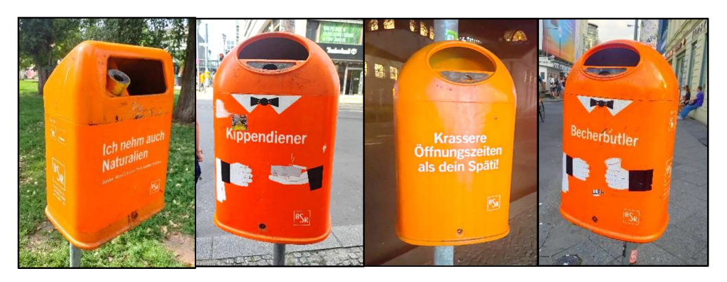
Figure 1: Trash bins with distinctive metaphorical slogans around the city of Berlin

Another example of using metaphors as slogans can be found on every orange-colored trash bin we encountered during our two-week stay in Berlin, Germany, in August 2023 (see Figure 1). Slogans like 'Kippendiener' (cigarette butts' servant), 'Krassere Öffnungszeiten als dein Späti' (Better opening times than your late-night shop), and 'Ich nehm auch Naturalien' (I also take natural things) are certainly not used merely for decoration. Behind them, the slogan creators have a specific mission to convey to the public. In general, it can be understood that these slogans transfer a message to the public to dispose of their trash in the designated place, which is the trash bins, and to consider environmental sustainability. In Berlin, waste management is entirely regulated by a service company, namely Berliner Stadtreinigung (BSR), which is responsible for garbage collection, street cleaning, and waste treatment ("BSR Information", n.d).