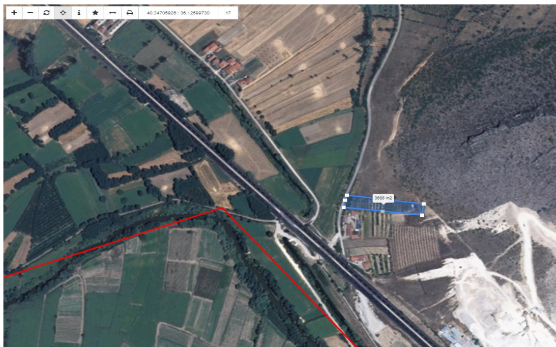
Figure 1. Aerial view of the land

The study was conducted on an agricultural land located 35 km away on the Tokat-Turhal highway. This plot spans an area of 3,688 square meters and exhibits hillside characteristics with a 25% slope. An aerial view of the land can be accessed in Figure 1. The land encompasses 22 distinct sections. These sections cultivate a variety of agricultural produce including apple and peach trees, grapevines, and crops such as tomatoes and peppers. Historically, this area employed a flood irrigation technique.