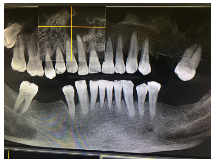
Figure 1: CT showing the periapical lesion at the roo of the upper right lateral insicor

received adjuvant radiation therapy in addition to surgery. The postoperative course was uneventful except for scar formation and no recurrence was observed for 6 months following surgery.