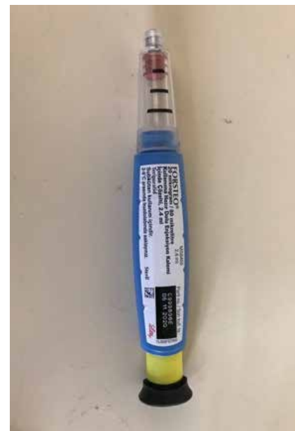
Figure 1: Teriparatide agent (Forsteo, Eli Lilly and Company, France) used in many defect areas

In order to provide general anesthesia, 90 mg/kg Ketamine HCl (Alfamime Ege-Vet, Turkey) and Xylazine HCl2 (Alfazyne Ege-Vet, Turkey) were injected intraperitoneally to all animals. The depth of general anesthesia was controlled by pedal reflex. After providing anesthesia, the right half of the mandible was preferred as the operation site in all animals. The surgical site