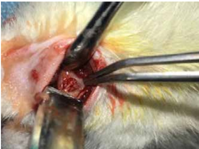
Figure 2: Particulate BLC placed in the surgical field.

In this study, the same amount of allograft was used to fill the defect area in 3 groups, groups 3-4-5, and only allograft was applied in group 3. In group 4-5, after allograft was applied, tp was applied to the defect area by dropping 20 mkg for group 4 and 40 mkg for group 5 in one go.