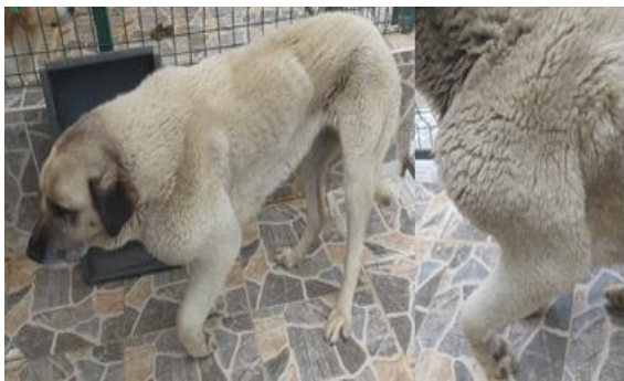
Figure 1. Image of the swelling in the patient's anterior left leg.

There was no general condition disorder in the clinical examination. However, on inspection, a diffuse swelling of the left forelimb, increasing from distal to proximal, was detected. While edema was detected in the distal parts of the left anterior extremity on palpation, these swellings were found to harden as it progressed proximally. In addition, a hard swelling as hard as a tennis ball was detected in the Triceps brachii muscle at the humerus level (Figure 1).