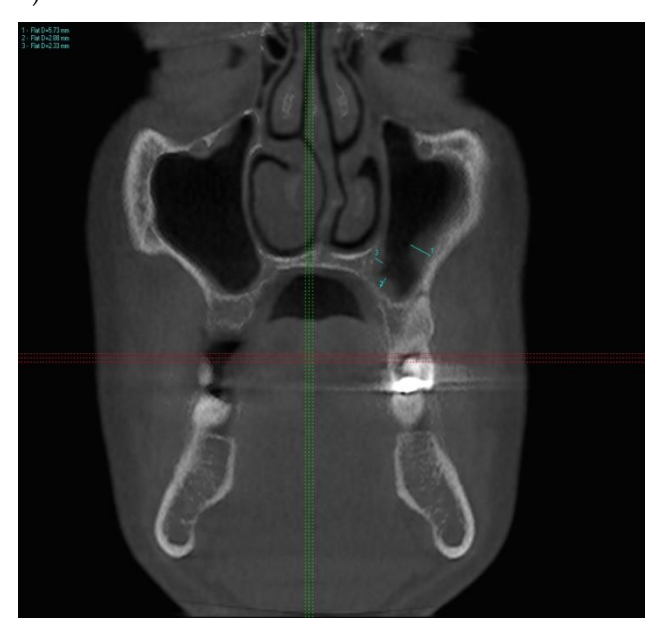
Figure 1. The maxillary sinus mucosal thickness measurements (MSMT) at the lateral wall of MS (1), MSMT at the base of the MS (2), and MSMT at the medial wall of the MS in coronal view (3)

sagittal, and axial sections. The MSM thicknesses were measured on the both edentulous and symmetrically toothed sides in the sinus floor, medial sinus wall, and lateral sinus wall, where the thickness was the highest in coronal view (Figure 1-2).