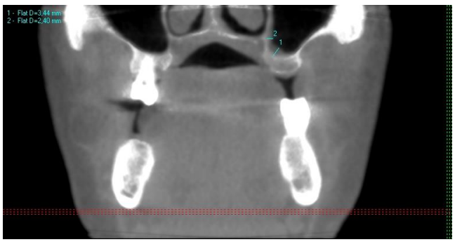
Figure 2. The maxillary sinus mucosal thickness measurements (MSMT) at the base of the MS (1), and MSMT at the medial wall of the MS in coronal view (2)

The presence of polyps in the right and left sinuses was also evaluated, and the data were recorded (Figure 3). The edentulous sides of the patients were determined as the study group and the symmetrically toothed sides of the patients were determined as the control group. The MSMT obtained at the sinus floor, medial sinus wall, and lateral sinus wall were compared between the two groups. The aim of this study was to determine whether single tooth loss is a risk factor for maxillary sinus mucosal thickening.