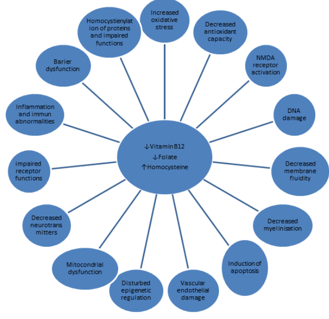
Figure 3. Possible pathophysiological effects of vitamin B12-folate deficiency and increased homocysteine