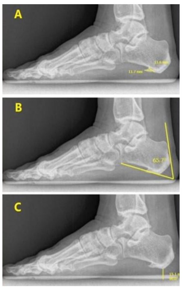
Figure 3. Morphometric measurements. (A: The plantar calcaneal spur thickness, B: Fowler-Philip angle, C: Plantar calcaneal fat tissue thickness)