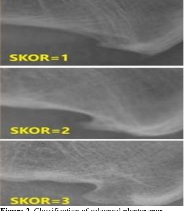
Figure 2. Classification of calcaneal plantar spur