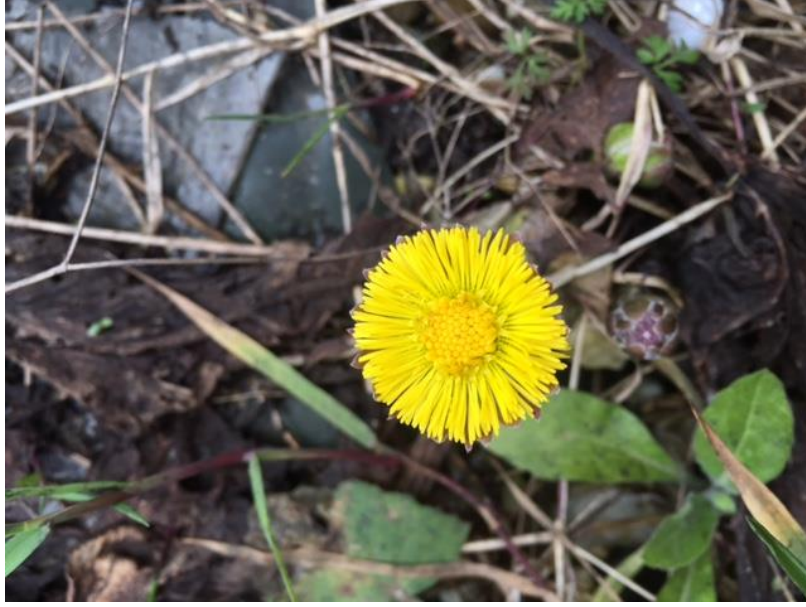
Figure 2. Tussilago farfara 'nın genel görüntüsü

pore 10.61 ± 1.19 µm long, 10.25 ± 1.48 wide; distinct margin and terminal edges acute, the pori situated at midpoint of colpus, are circular and with distinct margin. (Fig. 3, Table 1).