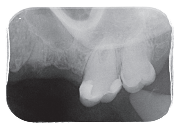
Figure 5: Periapical radiographs showing obliteration of pulp chambers and root canals