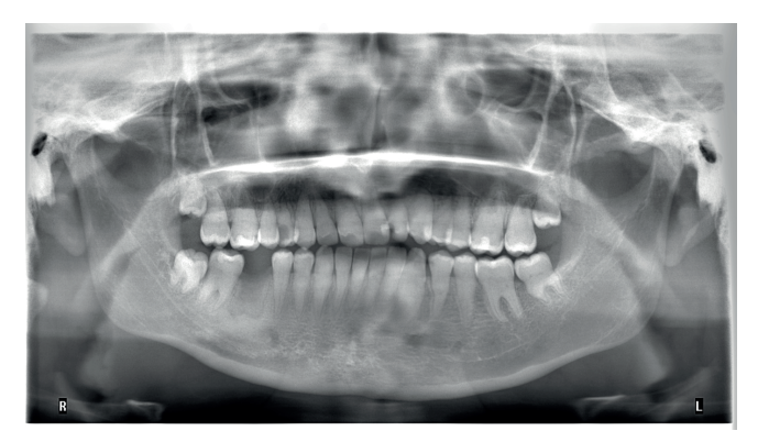
Figure 1: Patient's panoramic image; The X-ray was taken when the patient first applied to the faculty

A 21-year-old female patient presented to the Marmara University Faculty of Dentistry with a complaint of pain and advancing teeth mobility. Before coming to the faculty, the patient had previously visited a private dental clinic due to decayed teeth and pain. At this clinic, the patient underwent a tooth extraction procedure to alleviate the pain. When the patient applied to the faculty, her teeth were missing, decayed and mobile. The initial panoramic radiography, which was taken at the faculty, is shown in Figure 1.