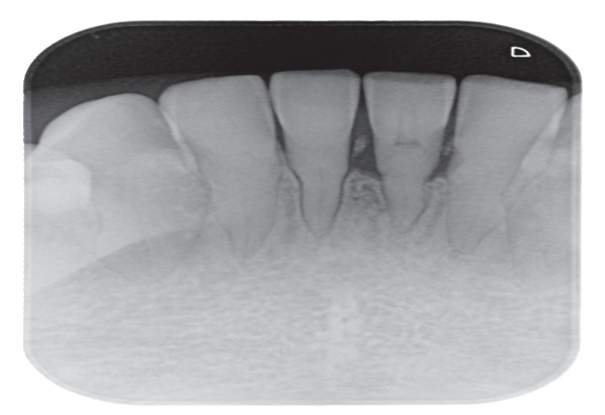
Figure 4: Periapical radiographs of the patient exhibiting bone loss

The patient exhibits general sensitivity to hot and cold, along with mobility in specific teeth. Especially tooth number 31 exhibited severe bone loss and mobility (Figure 4). Another noteworthy observation included the whole obliteration of both pulp chambers and root canals in all teeth. (Figure 5). Irregular areas on the root surfaces of some teeth were detected in periapical radiographs, such as in teeth numbered 33 and 34 (Figure 6).