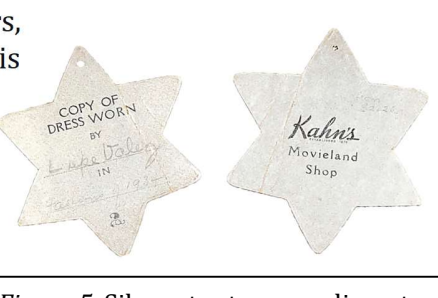
Figure 5. Silver star tag compliments of Kahn's Movieland Shop, 1934.

With the prevalence of films, theaters, stars, and gowns produced in 1934, it is unsurprising that such an error could occur. This small error of inaccurate attribution underscores Bouraman's assertion that during the 1930s, the emphasis was less on defining and emulating one film character but on personifying stardom generally (2017). Less importance given to a particular movie star may have reduced the