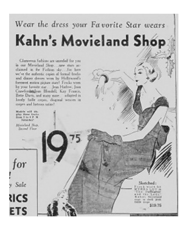
Figure 6. "Big Week at Kahn's-Wear the dress your Favorite Star wears." Advertisement from The Oakland Tribune, November 24, 1933.

shoulders to the back. They extend to a dramatic width past the shoulders. The skirt is streamlined and bias-cut with a godet sewn into each side seam. The length spreads past the shoes to drape in a pool along the floor. A thorough analysis of the garment revealed it had been worn and enjoyed. The dress exhibits stains from perspiration and several rips and holes, suggesting the hem had been repeatedly trod upon- not surprising due to its length.