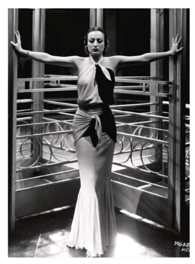
Figure 8. Joan Crawford's appearance in Letty Lynton, 1932. Dress designed by Adrian. Publicity photograph for MGM.

Fleming suggests new themes may emerge through an intersectional reading of the object in an opposing culture. "Reading" the costumes featured in the film Letty Lynton in a modern context offers new insights. The protagonist, Letty, first appears in a white diaphanous dress with capacious shoulders. Second, she appears in a sleeveless black and white halter sheath cut on the bias (See Figure 8). The two costumes represent a duality that her character plays out in the murder of her abusive fiancé. Though unwittingly, the woman portrayed is "a woman to contend with." Letty's portraval is as angelic and innocent, on the one hand, and on the other, a woman who takes the law into her own hands. Adrian often designed his costumes in black and white, and the second costume expresses the struggle evident in the film: the struggle between right and wrong/good and evil. According to Mircea Eliade, who wrote The Sacred and the Profane , portrayals of myths crop up repeatedly in contemporary media.