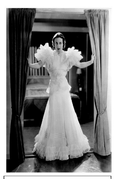
Figure 3. The infamous Letty Lynton Dress worn by Joan Crawford in the film Letty Lynton. Released in 1932. Publicity photograph for MGM.

The silver star tag attests that manufacturers produced this dress as a Hollywood replication gown. As early as 1925, fan magazines advertised "Screen Inspired Readymades," which readers could purchase through the publication (Berry, 2000, p. 11). They were either garments or patterns for garments made to reference the movie star who wore the dress in a recent film. Regrettably, few of these dresses exist today as the manufacturers used inexpensive, lower-quality materials and construction methods that reduced their longevity. The replicas were loose translations of the designer's original (Reyer, 2017) and quickly wore out. The Letty Lynton dress, produced in 1932 by the designer Gilbert Adrian for the film of the same name, was made famous by the alleged 500,000 reproductions sold through Macy's (See Figure 3). Well-known Hollywood costumers designed the original screen models, which were then contracted for reproduction by one of two intermediaries. The Modern Merchandising Bureau or Hollywood Fashions were middlemen who planned the garments consumer release with the film opening (Berry, 2000). Roger Eckart argued that this arrangement secured an agenda of product tie-ins between fashion and film and kindled a shift in the fashion industry where women looked to Hollywood for trend direction rather than Paris (Eckert, 1978; Berry, 2000; Richards, 1951).