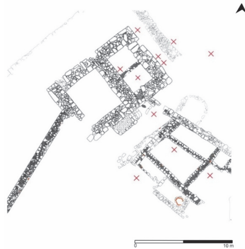
Fig. 2) The findspot of the oil lamps. (Excavation archive)