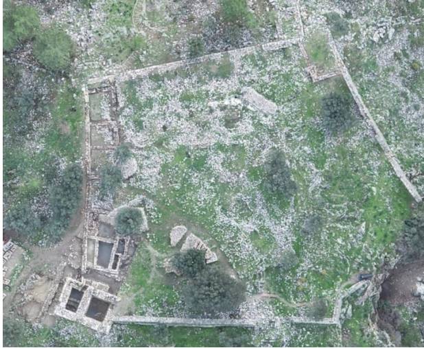
Fig. 1) An aerial view of the Kalynda from southwest

This study examines the examples of the famous wheel-made Rhodian oil lamps of the Hellenistic period discovered in the excavations at Asar Tepe, Şerefler. These artefacts contribute to our understanding of the Rhodian influence in the territory of Kalynda.