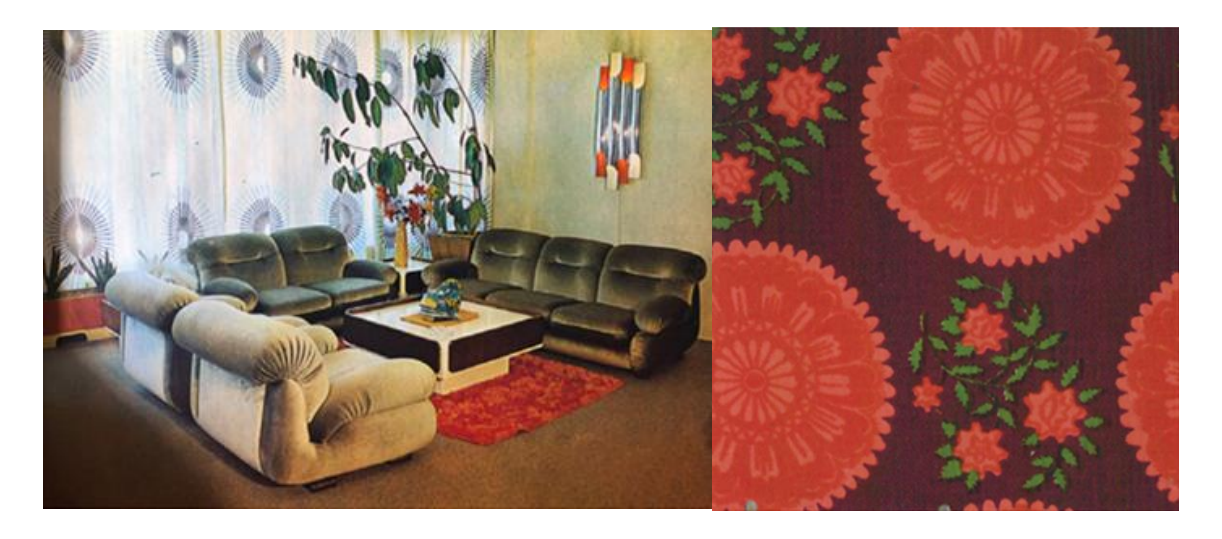
Figure 11. A Living room interior from Ev Dekorasyon Magazine, 1978 (Yaldız and Bahtiyar, 2021, p.156) and Sümerbank Textile Example (Floral Pattern), 1976 (TUDITA, 2015, p.71).

A living room from the 1970s is shown in this image from Ev Dekorasyon (Home Decoration) magazine. The sofa set in this example is covered in plain green velvet fabric. While the seats do not have patterns, the curtain has a large, stylized flower pattern, and the Sümerbank samples are decorated with stylized large flower patterns as well (Figure 11). In the Sümerbank example, these figures are combined with small and stylized flower groups. In Sümerbank pattern examples, simple and abstract patterns were more common in the 1980s and 90s.