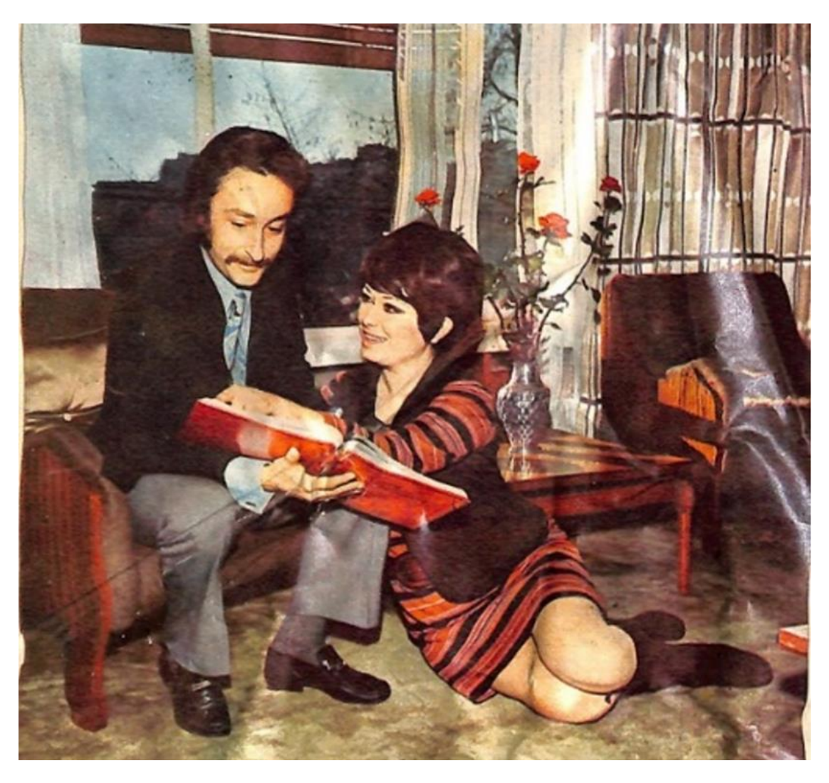
Figure 9. Homes of Celebrities, Ses, 26 December 1970 (Ses,1970).

In the 1970s living room geometrical patterns became popular. In the example, geometrical patterned curtain has rectangles arranged in a row (Figure 9). The patterns in the magazine example and the ones from the same period in Sümerbank are comparable, although the pattern's element distribution is less sequential. In the following years, Sümerbank's abstraction level increased and more vibrant colors were used in similar designs (Figure 10).