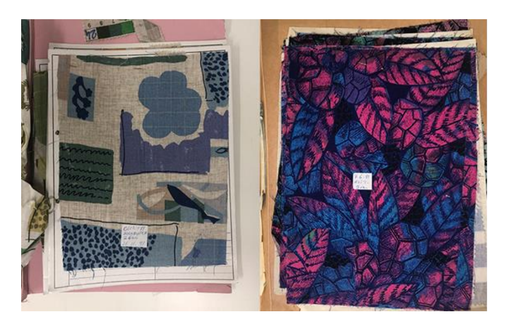
Figure 8. Sümerbank Pattern Design for Dornbusch in 1993, (Source: TUDITA, 2015)

Vibrant colors and abstract shapes were popular in textiles made in the 1990s for domestic as well as foreign companies (Figure 8).