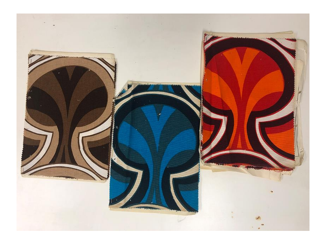
Figure 7. Sümerbank Pattern Design for Ikea in 1975 (TUDITA, 2015).

Vibrant colors and abstract shapes were popular in textiles made in the 1990s for domestic as well as foreign companies (Figure 8).