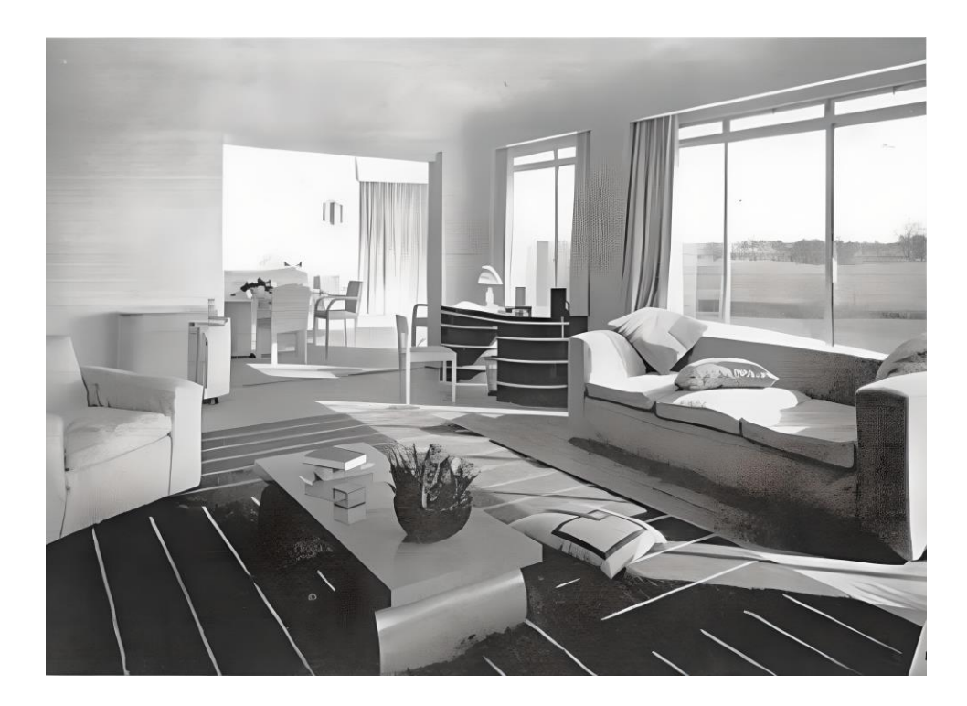
Figure 2. Modern Rugs and Interior Relation with the example from 1930s (Boydell, 1996, p.55).

Textiles were intentionally constructed to combine color, pattern, and texture to generate unity in interior design. Modernists deemed patterns acceptable only if they offered focal points in a space, such as a painting, a distinctive cloth, or, increasingly, a rug of modern design (Figure 2). As the 1930s progressed, many linear and abstract rugs were produced that demonstrated the idea that rugs should be designed to match current ideas regarding modern architecture: (Boydell,1996, p.55; Şahin, Özbent, Hasırcı, 2022).