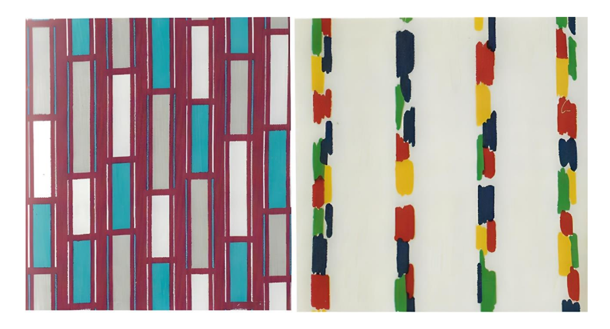
Figure 10. Sümerbank Hometextile Example (Geometrical Pattern),1986 and 1991 (TUDITA, 2015, p.110).

A living room from the 1970s is shown in this image from Ev Dekorasyon (Home Decoration) magazine. The sofa set in this example is covered in plain green velvet fabric. While the seats do not have patterns, the curtain has a large, stylized flower pattern, and the Sümerbank samples are decorated with stylized large flower patterns as well (Figure 11). In the Sümerbank example, these figures are combined with small and stylized flower groups. In Sümerbank pattern examples, simple and abstract patterns were more common in the 1980s and 90s.