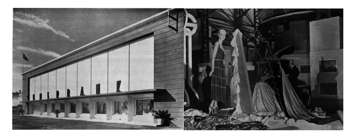
Figure 4. İstanbul Sümerbank Exhibition Pavilion Facade and The Textile Stand (Arkitekt, 1950).

The production of yarn, woven, printed and flannel fabrics has continued for many years to meet the needs of the public for all kinds of clothing and upholstery fabrics. During the Ottoman period, fabrics were valuable in monetary terms because they were made using valuable materials such as silk, gold, and silver: (Önder, 1995). Unlike the fabrics of the Ottoman period, Sümerbank fabrics were inexpensive, durable, high quality and elegant fabrics with unique patterns. Sümerbank's role in Turkish textile history, its use of domestic goods as a statist strategy, and its development politics through the country's economy all contributed to its cultural heritage (Figure 4). Despite the economic constraints that limited their material and color options, Sümerbank fabrics contributed to the creation of a national textile design aesthetic by introducing unique designs and their fabrics: (Bulgun, Adanır and Himam, 2015).