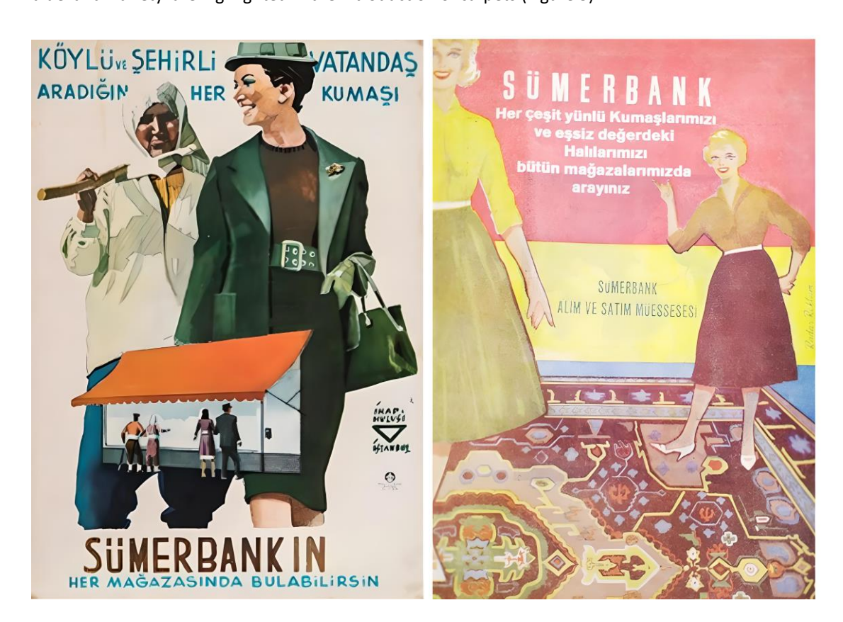
Figure 5. Sümerbank Advertisement from the 1950s (TUDITA, 2015, p.409).

In the advertisements of the period, textile companies have promoted their products with the emphasis of 'elegant woman' and 'happy modern nuclear family'. In the Sümerbank poster, the rural and modern women are imagined together with the focus of unity of society. It is evident from this advertisement that Sümerbank manufactures upholstery and curtain materials in addition to woolen carpets. This picture, shows women dressed in contemporary attire looking to an ethnically patterned woolen carpet. 'Unique value' and 'variety' are highlighted in the introduction of carpets (Figure 5).