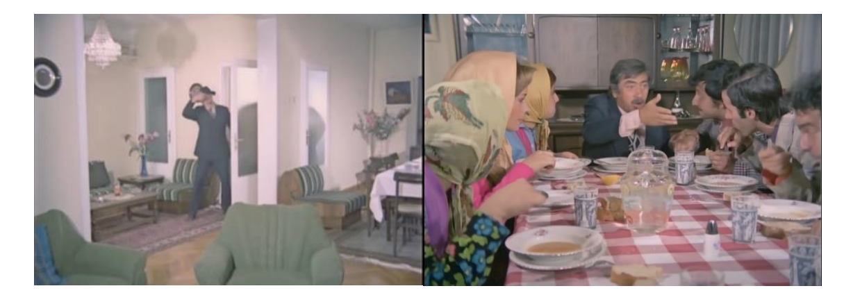
Figure 13. Movie Scenes from Köyden İndim Şehire (Ertem Eğilmez, 1974).

In the 1970s the transition is more visible. The living room has traditional carpets and chandeliers with a modular sofa set has striped pattern. Different types of tablecloths and curtains were used throughout this movie, including checkered, fruit-patterned, with figures, and small flowers (Figure 13).