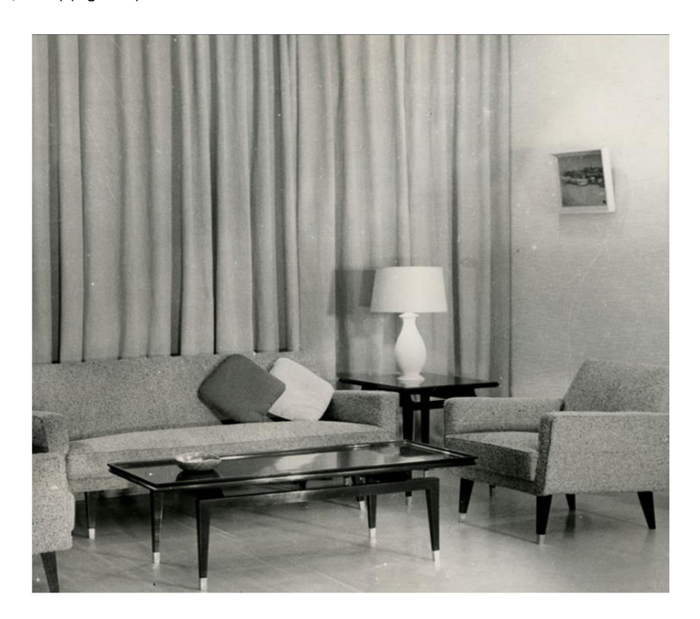
Figure 3. Moderno Company Living Room and Bedroom Set, 1950s, Önder Küçükerman and DATUMM Archives (Tuna Ultav, Z., Hasırcı, D., Borvalı, S. and Atmaca, H., (datumm.org, 2015).

Important examples of the relationship between textile and modern furniture in Turkey can be found in the DATUMM (Documenting and Archiving Turkish Modern Furniture) project, which examines modern furniture designed and produced in Turkey during the 20th century (Tuna Ultav, Hasırcı, Borvalı, and Atmaca, 2015) (Figure 3).