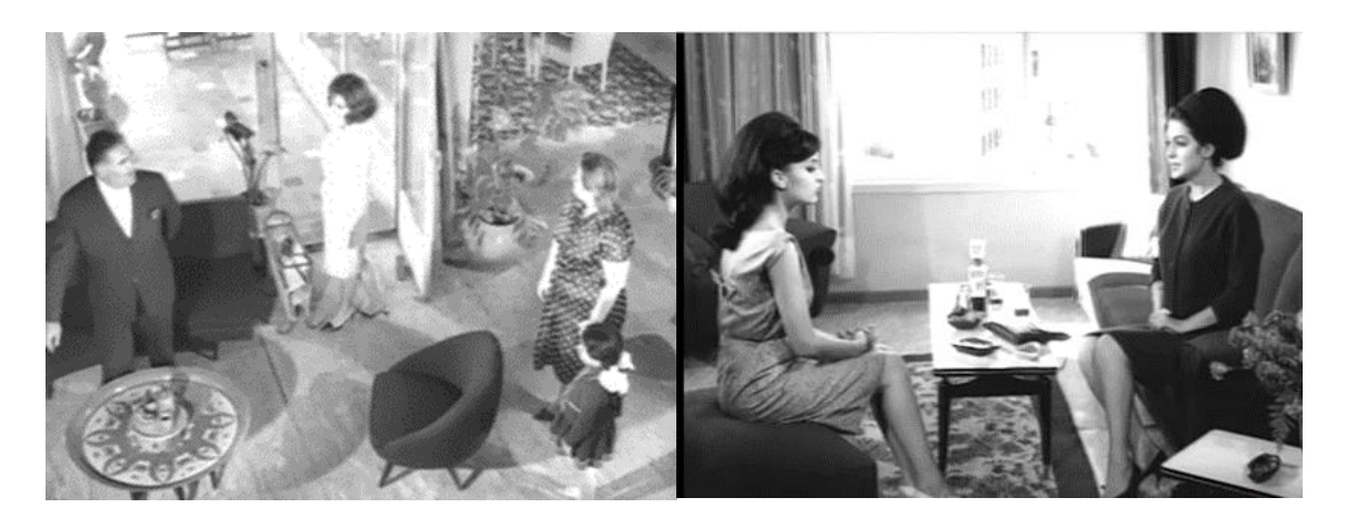
Figure 12. Movie Scenes from Kırık Hayatlar (Halit Refiğ,1965).

In the movies in the 60s, modern furniture, and traditional furniture, and textile products are used together. Striped patterns, polka dots, and leaf and floral patterns are also used together in the same interior space. Moreover, in the apartment scene, the carpet is the only patterned element as a focal point for the interior (Figure 12).