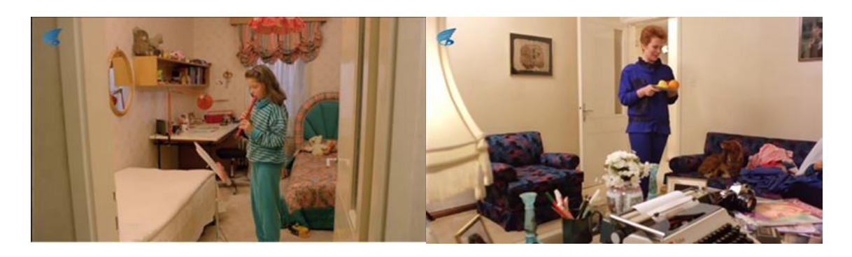
Figure 15. Movie Scenes Bir Kadın (Ümit Efekan, 1991).

In the 90s, Textiles have bright colors and abstract patterns widely. It is possible to see a modern aesthetic studying area in the children's room of the apartment, with features such as a moving office chair and a modular lamp. There is a wall-to-wall carpet covering the floor of the room. There is a thick striped pattern on the curtains which is modern, although the curtains do not have a modern style. The bedspread is the same color as the curtain and features a large, abstract floral pattern, a style that is commonly seen in Sümerbank archives dating back to the 1990s. There is a modular sofa set in the room along with a large desk, and the upholstery fabric of this sofa set has an abstract pattern that was very popular in the 1990s (Figure 15).