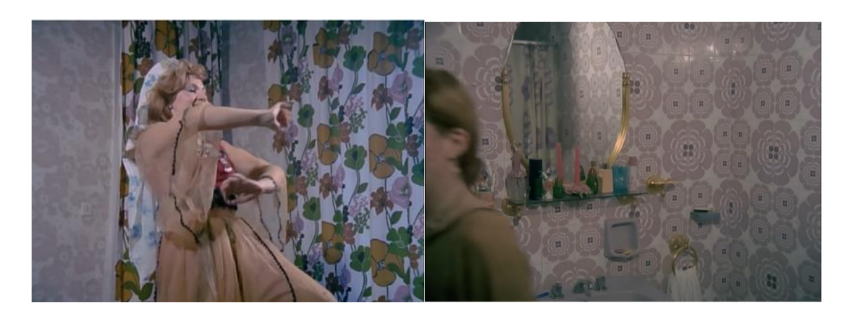
Figure 14. Movie Scenes Ne Olacak Şimdi? (Atıf Yılmaz, 1979).

At the end of the 70s, vivid colors and large figures were popular. Large flower figures were combined with geometrical shapes. A clear aesthetic understanding of the period can be seen in the ceramics used in the kitchen and bathroom, which are parallel to the textiles used in the interior. There is a high degree of abstraction in the flower patterns on ceramics, and the flowers are two-dimensional, with a regular arrangement of the flowers (Figure 14).