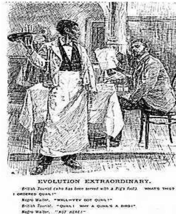
Figure 2. ("Punch")