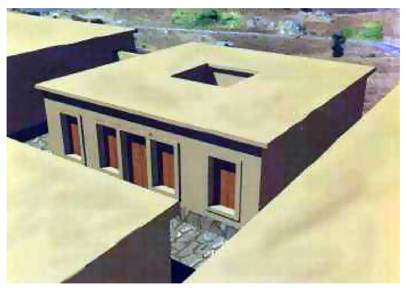
Figure 2: Rectangular basin, Boğazköy C building, Hattuša (Murat, 2012, 152)

It is inevitable that there will be sacred structures in or around these cities that stand out with their feature of containing holy water that purifies the sacred areas. Among these structures, rock monuments take the lead, and it is regarded that these monuments, which have relief depictions and are generally located in rocky areas, are directly related to the Anatolian water cult. A rectangular basin on the rock opposite Temple I in the middle of the Bogazköy C building in Hattuša (Fig. 2) is one of the best examples. It is thought that the water here was used not only for washing hands at the beginning of rituals but also in a sacred sense (Darga 1985, 158-160; Ünal, 1993, 136-137; Özkan 1996, 103; Seeher 2006, 119-120; Murat, 2012, 140).