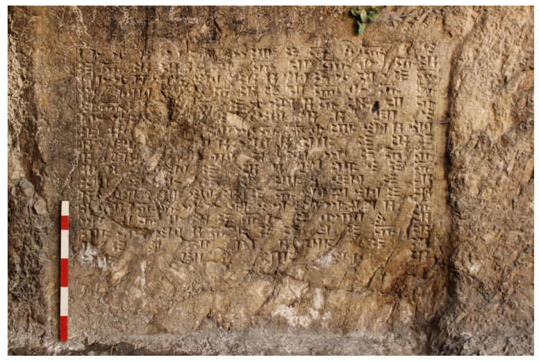
Figure 4: The entrance of Sirsini of Minua (Konyar et. Al. 2019, 178, Fig.22)

The importance that the Urartians gave to purification was also reflected in the findings of Tuspa Castle. The stele, placed on the right of the entrance of the building called "Širšini" (Salvini 2008, CTU A 5-68), is thought to have been used for a stable or similar purpose on the northern slopes of the castle, and the building stones around it indicate that this place was used for the "purification of sacred sacrificial animals" (Tarhan 2011, 318-320; Konyar et al. 2019, 177-190) (Fig. 4). However, it is not known whether water was used for this purification or not.