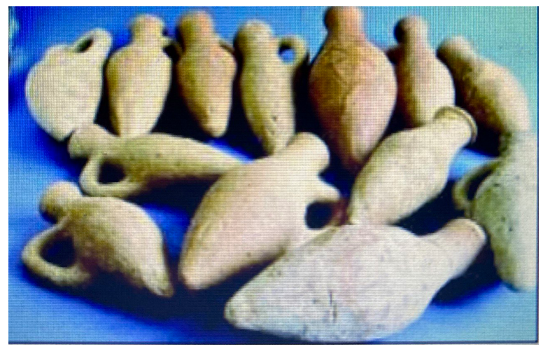
Figure 1: Some samples of šehelliški vessels, Šapinuwa (Süel 2010, 842, fig.9)

To purify the gods and goddesses, their temple centres must also be clean. In a ritual to purify the temple of Goddess Hepat again, that is, to clean and consecrate it, the statue of the god is cleaned with šehelliiaš (suppi-) water (KBo 9.119 A i 5), that is, "purification water", and it is sprinkled on the temple to purify Hepat's temple. (CTH472) Vs. II 4-6 (IV 23-25) (Lebrun 1979, 143-154). Containers carrying the sacred purification water used during the cleaning of temples are essential. They (Fig. 1) are referred to as šehelliški in the texts (Lebrun 1979, 143, 150-151; Tremouille 1996, 87-89; Mouton 2008, 1-17; Hutter 2013, 163).