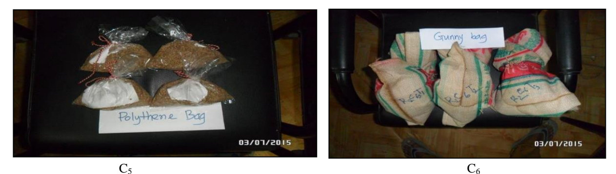
Figure 1. Different seed storing containers C1= Cloth bag, C2= Tin container, C3=Earthen pot, C4= Plastic container, C5= Polythene bag and C6= Gunny bag