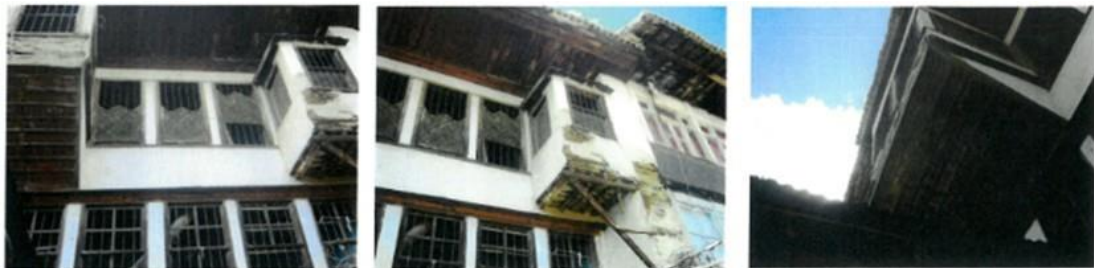
Figure 11. The general view of Ragıp Bey Residence.

This house was built in 1932. There are no houses in the house currently. The house has corner sofas, 9 rooms, 1 kitchen and 3 oriels (cumba) are found in this houses addressed to Ragıp Bey Street. Because the owner is not known, this house is called "Ragıp Bey House" with the name of the street where it is located. The three oriels, which are the characteristic feature of this house, look like closed when viewed from outside because of their localizations. Balconies open to exterior through windows which have shutters made up of wooden laths up to the mid-height. There is a toilet table with drawers integrated into the wall in the bedroom on the third floor. There are built-in closets in every room of the house. The house is now tumbledown as a result of neglecting (Fig. 11).