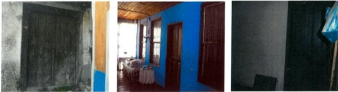
Figure 18. The doors of Talat Tarakçı House.

Outer door has ledged and lined wings. This basic type of door consists of lining boarding which is held together by ledges (Fig. 18, left). Solid wood interior door has raised panels fitted into frames (Fig. 18, middle and right).