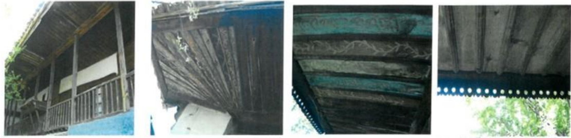
Figure 10. The eaves of Ahmet İşlak House.

Eaves were shaped in the form of a ring at the crown portion. Paintings in leaf patterns and inscription of construction date (1932) in Arabic letters are seen (Fig. 10).