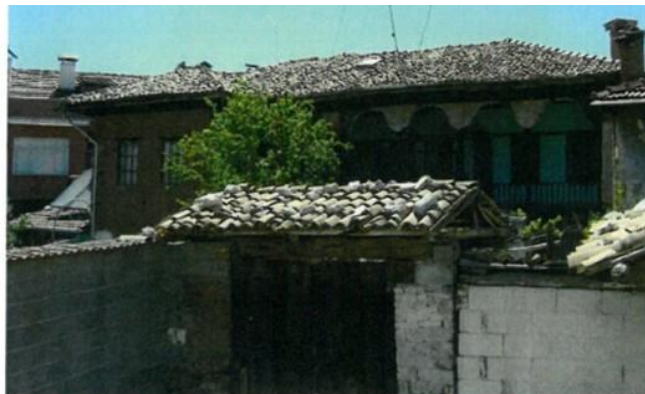
Figure 32. The general view of Şükrü Takım's House.

Third generation-relatives of Şükrü Takım reside now in this house which is claimed to be built in 1907. The knowledge related to the construction of it is insufficient. The house was built with an outer sofa and more than one row of rooms (Fig. 32).