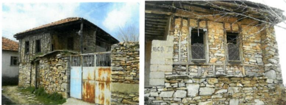
Figure 22. The general view of Mıstanlar’ House.

The construction is composed of stone walls and wooden studs (Fig. 22). The construction date is known as 1919. There are three rooms in this construction, two of which bearing doors with wood-based ornamentations.