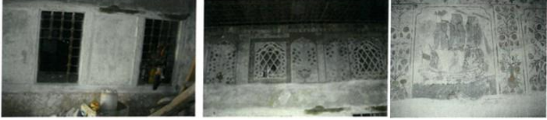
Figure 30. The windows of Saray House.

Guardrails with wooden covers (Fig. 30, left) and hand-carvings of the abat-jour (Fig. 30, mid and right) are seen.