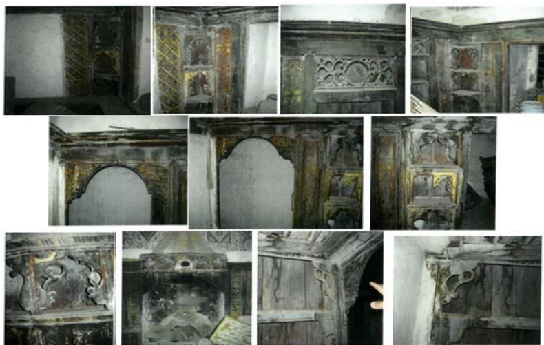
Figure 29. The closets of Saray House.

The surfaces of the closets are carved and decorated (Fig. 29).