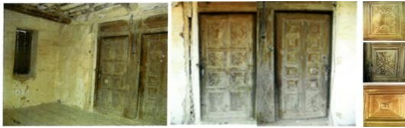
Figure 23. The doors of Mistanlar' House.

Solid wood inner door has raised panels fitted into the frames of Mistanlar' House. The tree of life motif was carved on the surface of the pillar sill between the two doors (Fig. 23, middle). Flower motif was carved on the surface of raised panels of the left door wing (Fig. 23, right middle and top). The raised panels of right door wing are constructed with 45° angle (Fig. 23, right bottom).