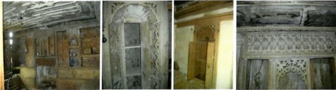
Figure 24. The closets of Mistanlar' House.

There are carvings on the wooden surfaces of Mistanlar' House closets carved with wood jigsaws (Fig. 24).