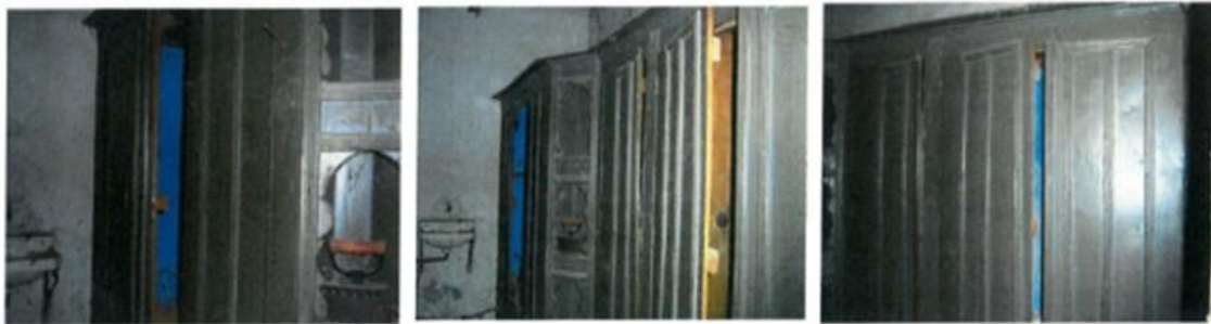
Figure 19. The closets of Talat Tarakçı House.

Closets of this house have ledged and lined doors. Frame construction was applied to the closet doors (Fig. 19).