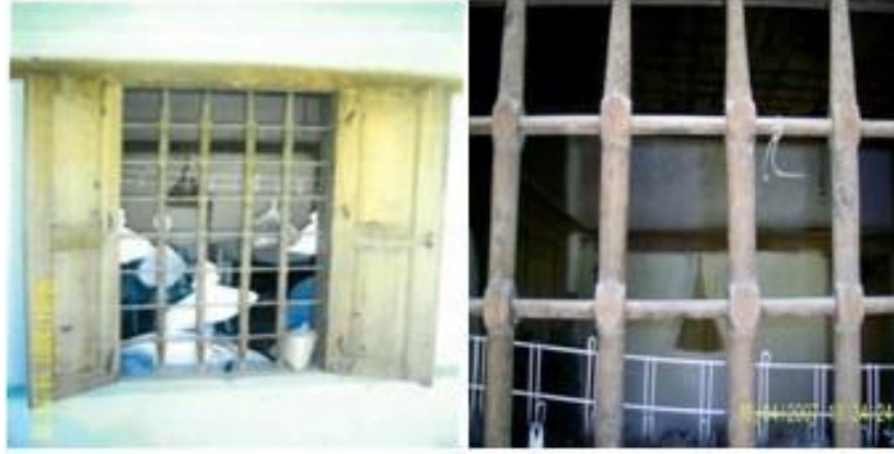
Figure 36. The windows of Şükrü Takım's House.

Window ornamentations of the house are made of wooden railings which are similar to iron counterparts (Fig. 36).