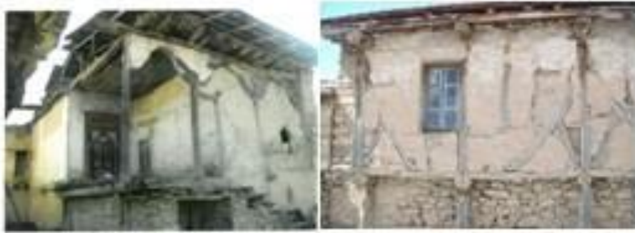
Figure 27. The general view of Saray House.