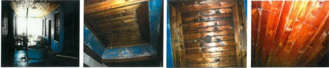
Figure 21. The ceilings of Talat Tarakçı House.

The ceilings of Talat Tarakçı House are constructed flat (Fig. 21, left and right) and dome-like (Fig. 21, middle). Dome-like ceiling structure in the middle of the vestibule on the top floor makes the vestibule more spacious. Iron sconce located in the middle of the dome-like ceiling features iron work, although not delicate.