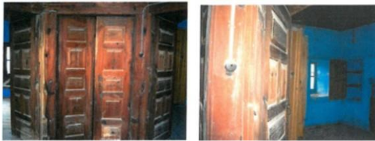
Figure 12. Raised door panels of Ragıp Bey House.

The figure below shows the main components of a traditional timber door. The whole components (rails, casements, and panels) of the door are solid wood. Raised panels are fitted into frames. It is a carpentry technique that has been around for hundreds of years. The edge of a “thick” panel or board is reduced down so that it can be fitted into a rebate in the frame (Fig. 12).