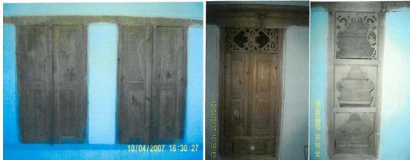
Figure 35. The general view of Şükrü Takım's House.

Closets have ledged and lined wings. This basic type of door/closet consists of lining boarding which is held together by ledges. Closets were produced as winged and unwinged. The racks of unwinged closets are arched (Fig. 35).