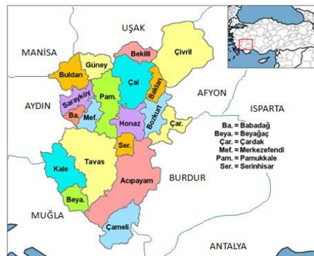
Figure 1. Map of the districts of Denizli province in Turkey [3].

Denizli is a province of Turkey in Western Anatolia, on high ground above the Aegean coast. Neighboring provinces are Uşak to the north, Burdur, Isparta, Afyon to the east, Aydın, Manisa to the west and Muğla to the South (Fig. 1). Besides its center, it has 18 districts, the most populated of them being Acıpayam, Tavas, Çivril, Çal, Sarayköy and Buldan. The smallest of 18 districts is Babadağ. Denizli is a growing industrial city in the southwestern part of Turkey and the eastern end of the alluvial valley formed by the river Büyük Menderes, where the plain reaches an elevation of about three hundred and fifty meters. Denizli is located in the country's Aegean Region. Approximately 28-30% of the land is plain, 25% is high plateau and tableland, and 47% is mountainous. In general, the Aegean region has a mild climate. However, it becomes harsher at altitude. Temperatures can rise to 40 °C during summer and fall to -10 °C in winter. There are about 80 days with precipitation, mainly during winter [1-2].