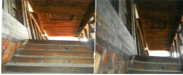
Figure 4. The staircase of Ahmet İşlak House.