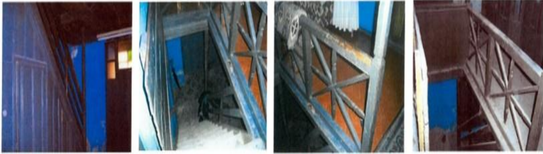
Figure 17. The stairs of Talat Tarakçı House.