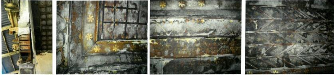
Figure 31. The ceilings of Saray House.

Hand-carved ceilings of Saray House are seen in Fig. 31.