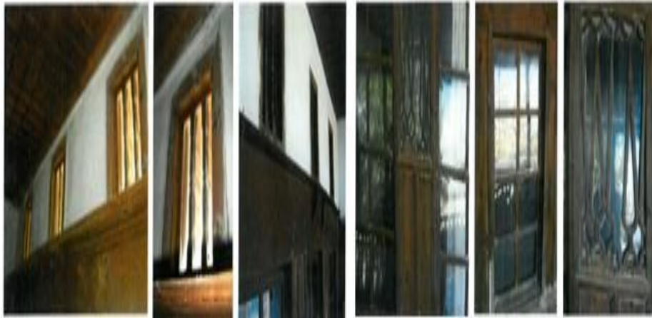
Figure 8. Windows and their ornaments in Ahmet İşlak House.

Large windows spaced with a certain distance engage attention on the “facing outward” aspect of the house. Smaller windows were placed above the others to provide more enlightenment. Laths were placed in front of the window glasses forming railings in a certain pattern (Fig. 8).