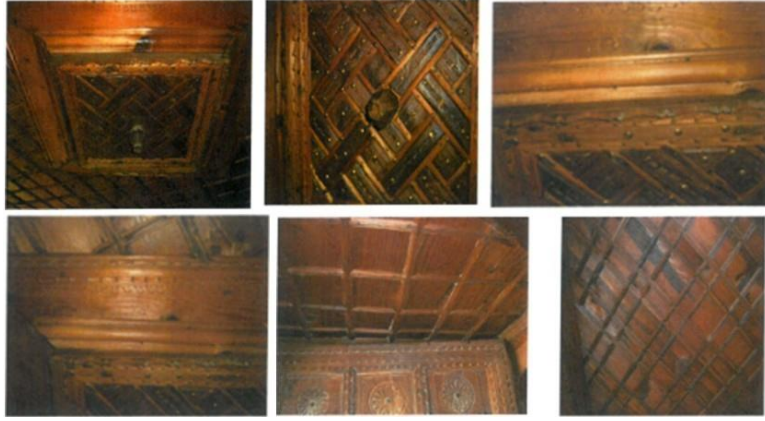
Figure 9. Centrally “Kündekari” and lattage (Çıtakari) techniques in the ceiling of Ahmet İşlak House.