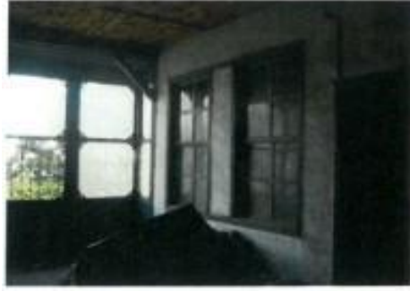
Figure 20. The windows of Talat Tarakçı House.