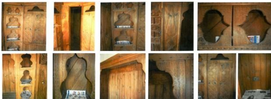
Figure 6. Closets and their ornaments in Ahmet İşlak House.

Closets were produced as winged and wingless. The racks of wingless closets are arched. Closet rails are notch-carved as in doors. 45° angle rhombi and floral motifs carved within tree of life motifs are seen on the wing panels (Fig. 6).