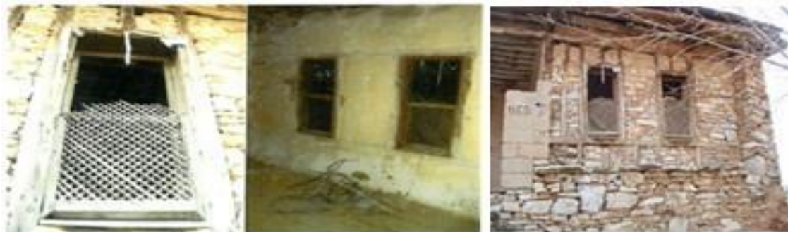
Figure 25. The windows of Mistanlar' House.

Lattice work shutters and sliding sash on the windows of Mistanlar' House (Fig. 25).