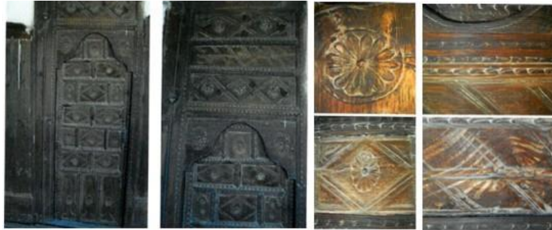
Figure 5. The door with ornaments in Ahmet İşlak House.

Rectangular door wing is incorporated with side closets and arched door frame which continues to the ceiling. Different applications of motifs are seen on the surfaces. For instance, notch carvings on the rails of frame and door leaf; quadratic and rhombus carvings on panel surfaces and flower carvings on the frame surrounding it; and finally tree of life motif on the lower part of door wing were applied (Fig. 5).