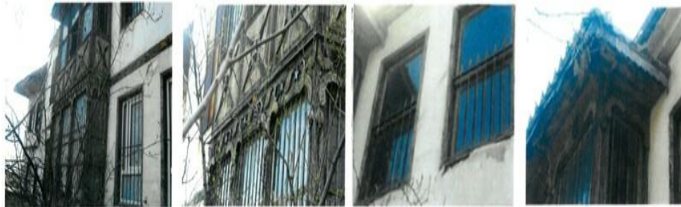
Figure 16. The general view of Talat Tarakçı House.

Talat Tarakçı served as the mayor of Buldan between 1926-1929. The house of interest was built during his mayoral term. Star and crescent ornamentations predominate on the exterior aspect (Fig. 16). This three-storey house has one front yard, one backyard and three garden entrances. Two rooms and one basement are found on the lower floor. There is a vestibule enclosed with a showcase on the mid-floor. There are 4 rooms leading to this vestibule. In the center of this vestibule there is a fountain used to cool the house in summers. A bathing cubicle is located under the stairs (Fig. 17, left). As for the top floor, there are four rooms, two on the right and two on the left side with indoors connecting them to each other, opening to the same vestibule. On this floor there is a bathing cubicle in a built-in closet (Fig. 17) and there are toilet rooms on each floor. The vestibule on the top floor has a dome-like ceiling.