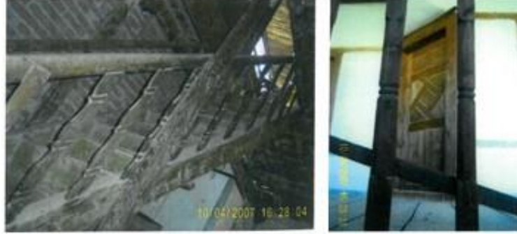
Figure 33. The stairs of Şükrü Takım's House.

The staircase made of pine wood was built to connect two storeys in the house of Şükrü Takım. The house has a straight-flight staircase. The balusters are adorned with laths (Fig. 33).