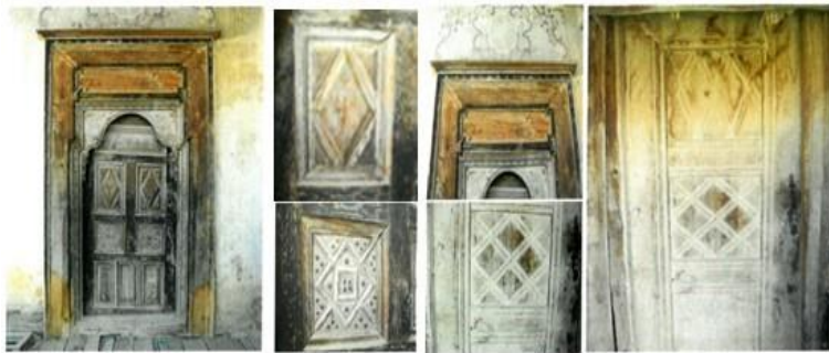
Figure 28. The doors of Saray House.

The doors of Saray house are made of solid wood raised panel and arch (Fig. 28). The surfaces of the doors are carved and decorated.