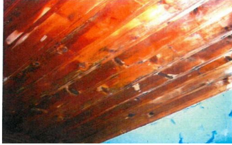
Figure 15. The ceiling of Ragıp Bey House.

This house has a flat ceiling. It is the most widely used ceiling type in the traditional Turkish house [16]. Its application is done by putting the wood pieces which have been prepared for ceiling covering side by side and assembling them with lower parts of the wooden boards (Fig. 15).