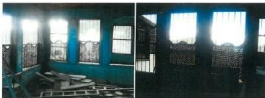
Figure 14. The windows of Ragıp Bey House.

Lattice work shutters over the windows of Ragıp Bey House (Fig. 11 and 14).