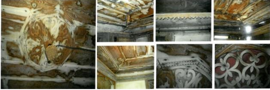
Figure 26. The ceilings of Mistanlar' House.

Carvings were applied with wood jigsaws in the construction of the ceilings' centers and edges of Mistanlar' House (Fig. 26).