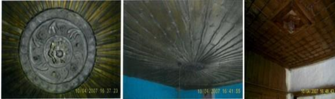
Figure 37. The ceilings of Şükrü Takım's House.

The ceiling of the house is curved and has a round core. Applied bars spread like sun beams from the center to the wall (Fig. 37).