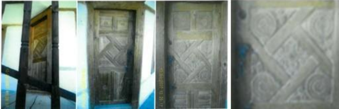
Figure 34. The doors of Şükrü Takım's House.

Solid wooden interior doors have raised panels fitted in to the frames of Şükrü Takım's House. The surface of the raised panels of the left door wing is flower carved. The raised mid panels of door wing are constructed with 45° angle (Fig. 34).