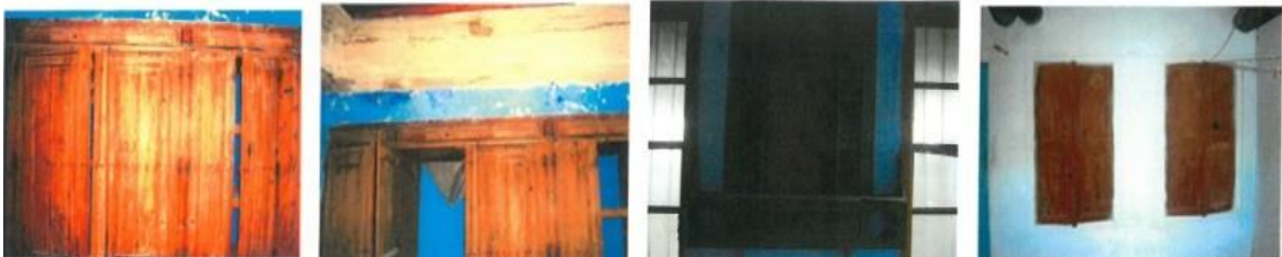
Figure 13. The closets of Ragıp Bey House.

Closets have ledged and lined wings. This basic type of door/closet consists of lining boarding which is held together by ledges (Fig. 13).