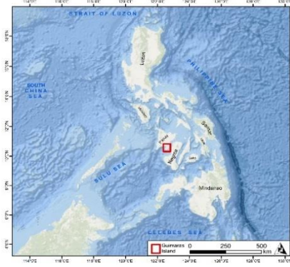
Figure 1. Location Map of the Guimaras Province

Tourists visiting Guimaras Province can easily access many accommodation facilities suitable for every purpose and every budget. Although more than 110 accommodation facilities operate within the borders of the state, there are no four or five-star hotels among them. There is a shortage of luxury hotels in Guimaras Province, as seen in many Philippine provinces. Most of the modern tourist establishments in the state are located in the city of Jordan and its immediate surroundings and on the seaside of Nueva Valencia district. There are more than 10 tourist caves and more than 40 natural beach areas within the state borders. In fact, marine tourism is one of the most popular tourism activities in Guimaras Province, and the total coastline of the province reaches 470 kilometers.