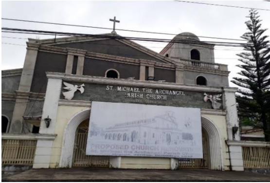
Photo 3: St. Michael The Archangel Parish Church –Jordan

Isla Naburot, a small island, is one of the most privileged, interesting and beautiful islands in the Province of Guimaras. Located off the west coast of Guimaras Island, this small islet is located 5-6 km from Natago Beach. It is a private island because it is actually owned by a family, but it is one of the iconic attractions of the State of Guimaras. The island, which can only be reached by boats, is visited by tourists every year for a privileged sea holiday, albeit in small numbers. Small family business called "Isla Naburot Resort" provides accommodation and food and beverage services to curious visitors all year round. Due to the high prices of accommodation on the island, "Isla Naburot Resort" generally serves more of the rich and mysterious local tourists from the city of Iloilo, who prefer vacation away from prying eyes.