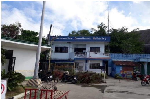
Photo 4: Jordan Wharf Ferry Terminal - Province of Guimaras

notable for its large garden and interesting architecture. The façade of the Navalas Church, made of huge limestones and with a simple design, gave it the appearance of a medieval castle. In the high bell tower of the church are two large tablets with the Holy Ten Commandments, written in the local Hiligaynon language (PEMSEA and Provincial Government of Guimaras Philippines, 2020).