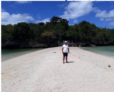
Photo 1: Baras Balabag Sand Bar - Province of Guimaras

The largest island of the Province of Guimaras in terms of both population and surface area is Guimaras Island. Guimaras Island alone accounts for more than 98% of both the state's territory and the province's population. Stuck between Negros and the Panay Islands, Guimaras Island is mathematically located between 10°25'00"-