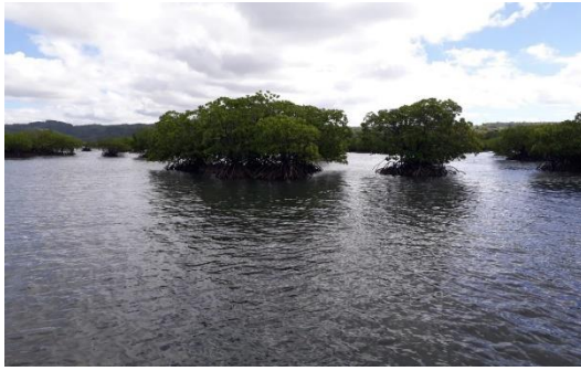
Photo 2: Taklong Island National Marine Reserve - Province of Guimaras

tourists vacationing on Alubihod Beach visit the nearby beaches "Kaliruhan Beach", "Villa Corazon Beach" and "Rico Beach Resort". Alubihod Beach is a free public beach that is open to everyone. In the immediate vicinity for those who want to get accommodation service; Not very expensive, 2- and 3-star budget hotels such as "Alobijod Cove Resort", "Raymen Beach Resort", "Rico Beach Resort", "California Coral Beach Resort" and "Avista Grande Beach Resort" operate (Waypointsdotph, 2023).