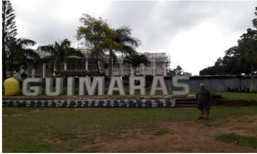
Photo 5: Jordan, capital of the province of Guimaras

"San Lorenzo Wind Farm" or "Guimaras Wind", a pioneering renewable energy project of the Visayas Region, was established on the east coast of Guimaras Island with the aim of meeting the rapidly growing national economy and the growing regional energy demand (Detourista, 2023). the east coast of Guimaras Island; Since it is one of the windiest regions of the Philippines, it is one of the most accurate geographical locations to produce wind energy. The 54-megawatt "San Lorenzo Wind Farm", which became operational in 2014, is the first of its kind built in the Visayas Region. This wind farm consists of a total of 27 wind turbines, each at an altitude of about 123 meters and producing about 2 megawatts of power, and has the capacity to generate a total of 54 megawatts of renewable energy (Jon to the World, 2023). With all these features, "San Lorenzo Wind Farm" is one of the largest wind farms not only in the Philippine islands but also in all of Southeast Asia. It is well suited for hiking, organizing picnics, or watching huge wind turbines (Guide to the Philippines, 2023b). The training center for engineers serves as a place where visitors can rest. It hosts day visitors with giant windmills, cruising grounds and mango farms (Nofuente, 2023).