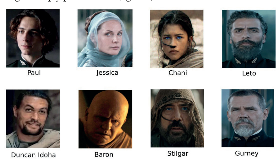
Figure 4: Character Pictures Corresponding to Sentiment Analysis Results (Dune, 2021)

The sentiment analysis of the dialogues and mentions of key characters within the "Dune (2021)" movie script offers insightful revelations about the emotional and subjective landscapes navigated by these individuals. As depicted in Table 3, the character Stilgar exhibits the highest positivity in terms of polarity (0.224) and the greatest depth of subjectivity (0.602), indicating a narrative rich in personal perspective and emotional nuance. Contrastingly, the Baron's portrayal is markedly negative (polarity of -0.1189), aligning with his antagonistic role, and is coupled with a high level of subjectivity (0.493), suggesting a complex character depicted through a deeply personal lens (figure 4).