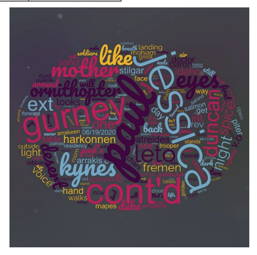
Figure 1: Word Cloud for Dune I