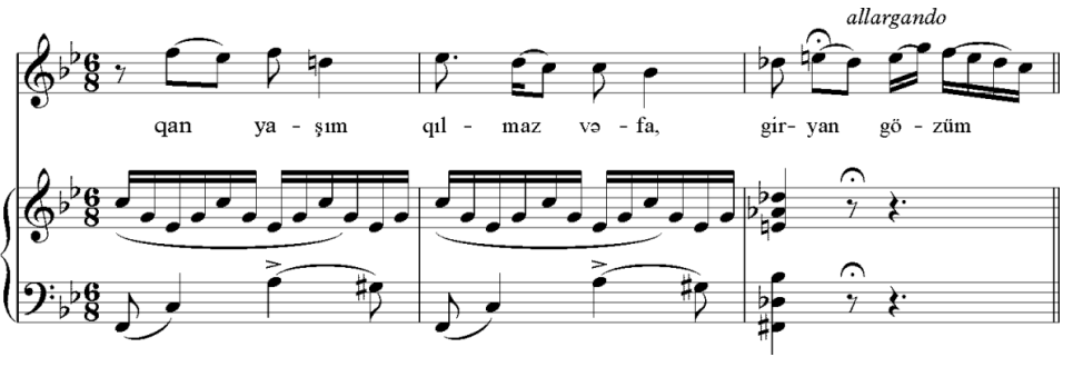
Figure 3. Part B in the ghasal-romance by Oktay Zulfugarov "Yad Eylerem"

here the culmination of the piece occurs. The character of the work becomes serious due to the agogic performance in the vocal part. Rast and shushtar intonations alternate in this section (Figure 3).