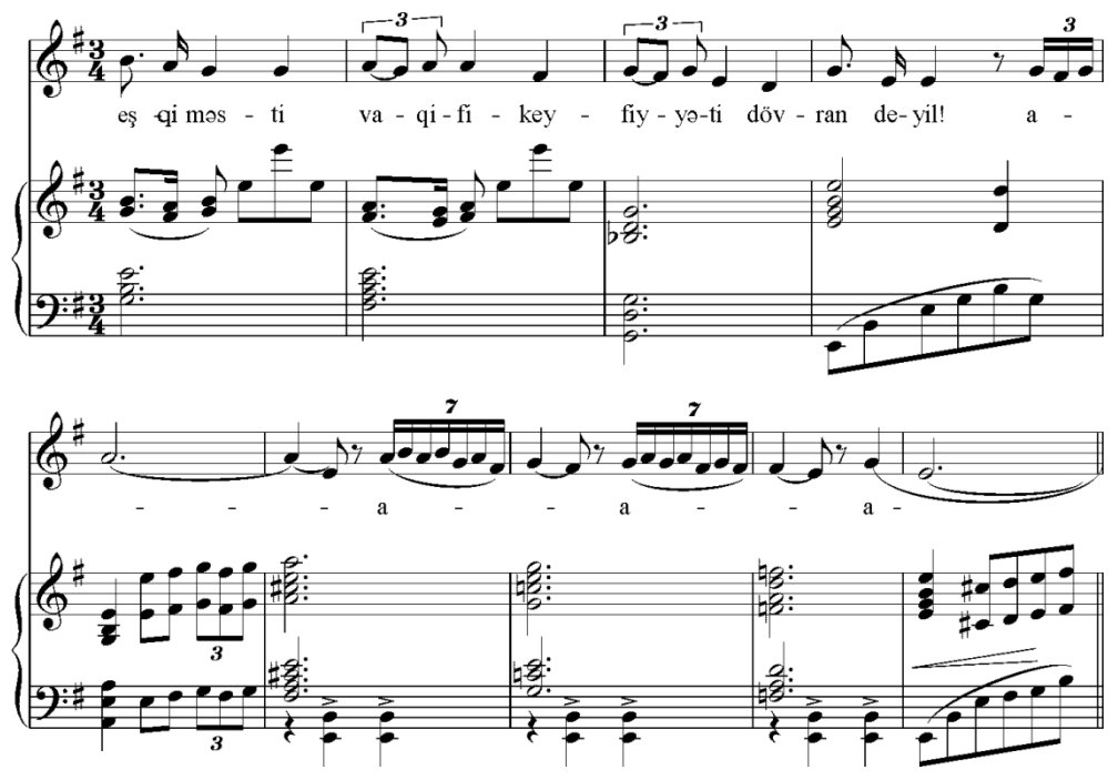
Figure 14. B parts in the ghasal-romance by S.Rustamov "Deyil"

own characteristics. At the end of the bayt, the composer again prefers vocalization over the vowel "A" and completes the B part in the shur-shahnaz step (Figure 14).