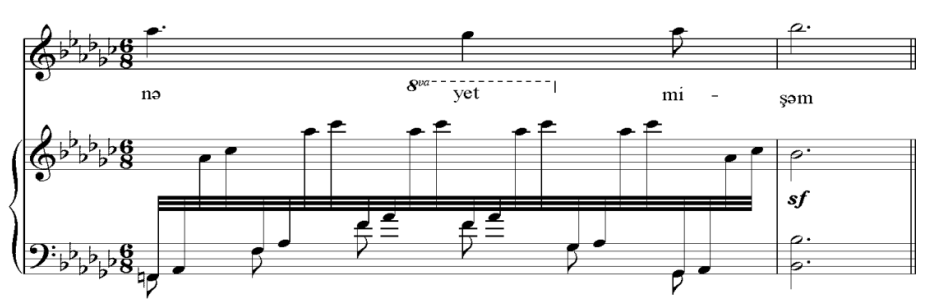
Figure 6. Piano arpeggios in section B

Section A_1 is played in A Tempo. It is repeated 2 times using the 1st period of part A. The ghazal-romance ends at the E-flat rast