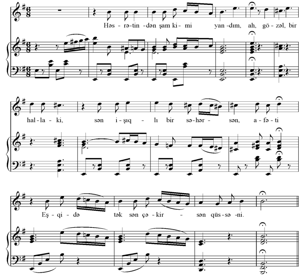
Figure 10. Part B in ghazal-romance "Afeti jansan mene"

correspond to the voice sequence of the C flat segah makham (lad). At the end of the question sentence, shur intonation sounds again. The response sentence continues with the vocalist a cappella singing. Such a structure of part B is expressed in the form of an asymmetric period. At the end of the part, the reference of the e shur maqam to the step of maya and hijaz can be seen evidently (Figure 10).