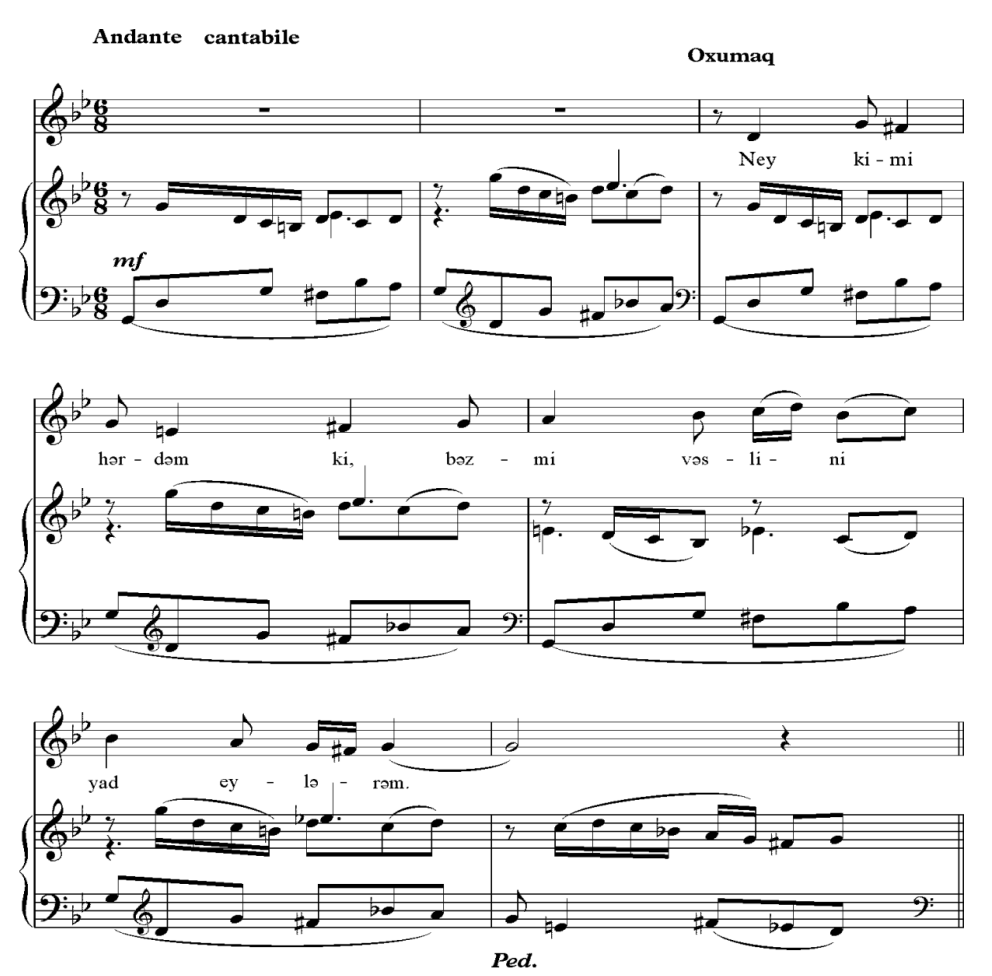
Figure 2. Part A in the ghasal-romance by Oktay Zulfugarov "Yad Eylerem"

In the part B, the composer used shushtar intonations. These intonations correspond to the of F shushtar makham (lad). In this section, the composer uses the allarganda to place question-and-answer sentences, and