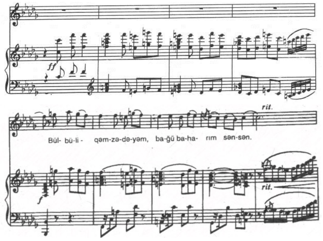
Figure 17. Part C and culmination in S. Alasgarov's ghazal-romance "Vetenimdir"

of the manandi-mukhalif step, sounding in the nuance ff. The work ends with a Coda (Figure 17).