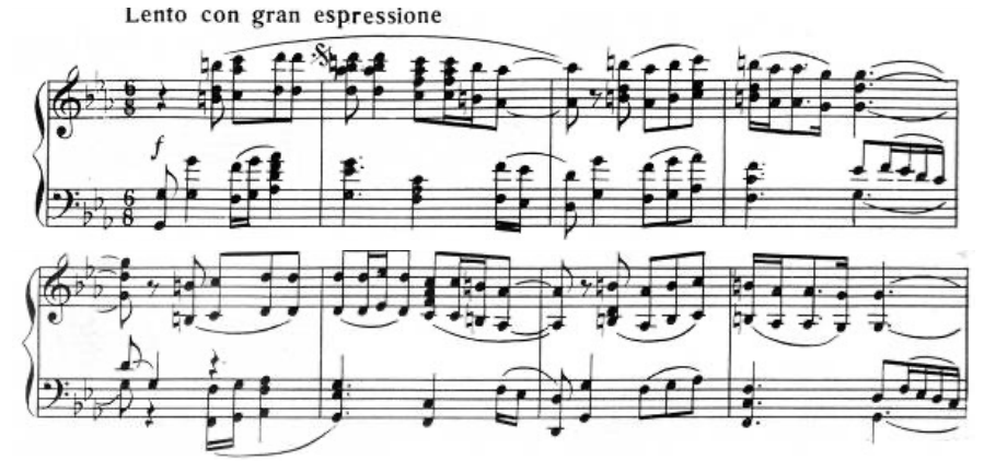
Figure 24. Introduction part in A. Abbasov's ghazal-romance "Ey Fuzuli"

part first corresponds to maya humayun and the answer sentence corresponds to the G shushtar makham (lad) (Figure 24).