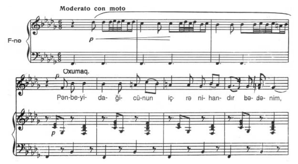
Figure 16. Introduction part in S. Alasgarov's ghazal-romance "Vetenimdir"

romance, the above features are more pronounced. This work with a lyrical mood is written in Allegro con moto tempo. The introductory part of the work is based on the material of the refrain of the B section. The structure of the ghazal-romance is Intro+A+B+C+B1, in rondo couplet form. The theme in the introduction and the A part are on the shushtar intonation and corresponding to the voice consequences of the B shushtar. This part begins with the performance of the vocalist (Figür 16).