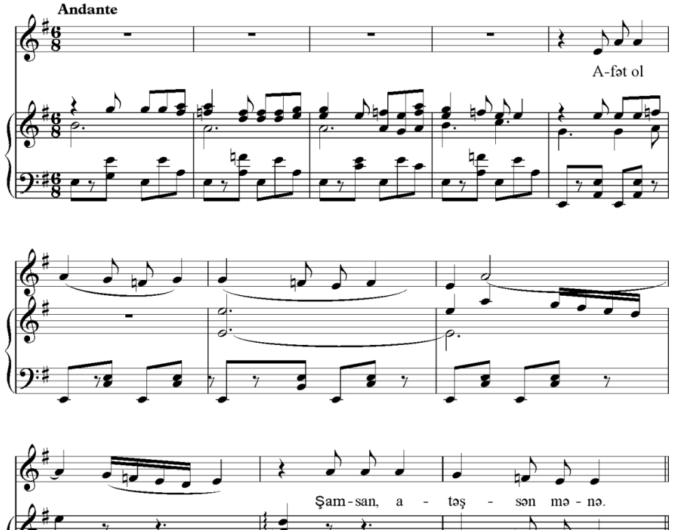
Figure 9. Introductory and A parts in the ghasal-romance by A.Rzayeva "Afeti jansan mene"

Ghazel-romance begins with instrumental piano introduction. After the introduction, the vocal part enters with a perfect fourth jump. During the performance of the vocal part, the voiced phrases are repeated with options and variations. In part A, the interrogative sentence is repeated 2 times in a variant form, and the 1st phrase of the response sentence is repeated 2 times in a variant form (Figure 9).