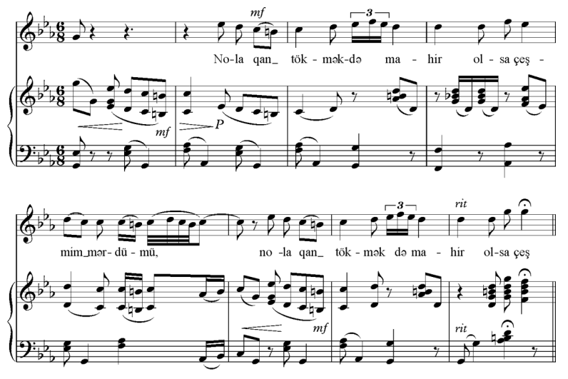
Figure 26. Full cadence in part B in A. Abbasov's ghazal-romance "Ey Fuzuli"

of this period refers to the do half cadence of the G shushtar step, and the ritenuto part of the answer sentence refers to the F full cadence of the A humayun (Figure 26).