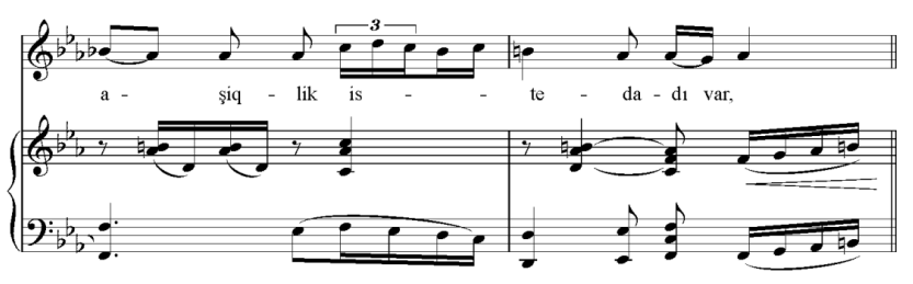
Figure 25. Part A in A. Abbasov's ghazal-romance "Ey Fuzuli"