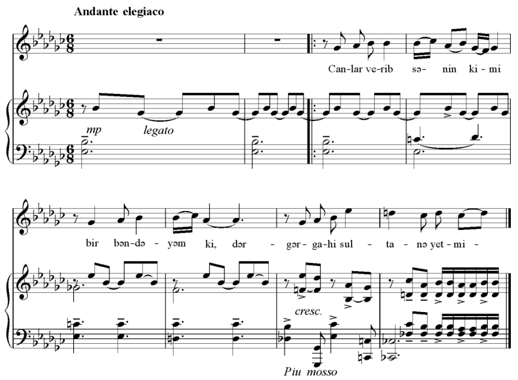
Figure 5. Introduction and part A in the ghazal-romance "Janane yetmishe

Section B starts in tempo Piu mosso. The arpeggio sounds in the piano accompaniment are evident here. There is one period in part B. The interrogative sentence of the period refers to irak step of makham (lad). there are instrumental interlude between the interrogative sentence and the response sentence. In the response sentence there is an obvious reference to the rak step of the E-flat rast. In this episode, the culmination of the piece occures in the rak step (Figure 6).