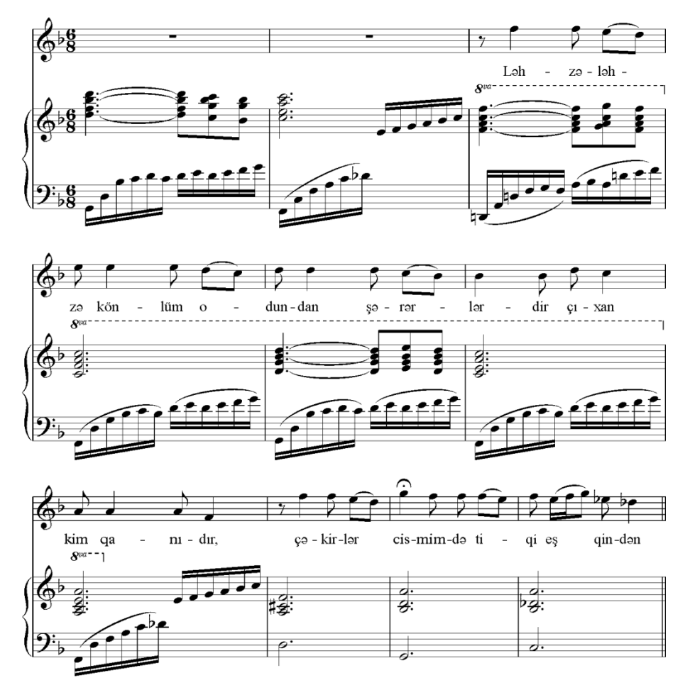
Figure 21. Part B in R. Mustafayev's ghazal-romance "Malahat sultani"

belongs to the position of A segah. This interrogative sentence is complete in shikasteyi-fars. The response sentence ends on the basic tone of A segah. The culmination of the piece occurs in the vocal part in the 2nd repetition of the period. While repeating, the 2nd period is repeated twice (Figure 21).