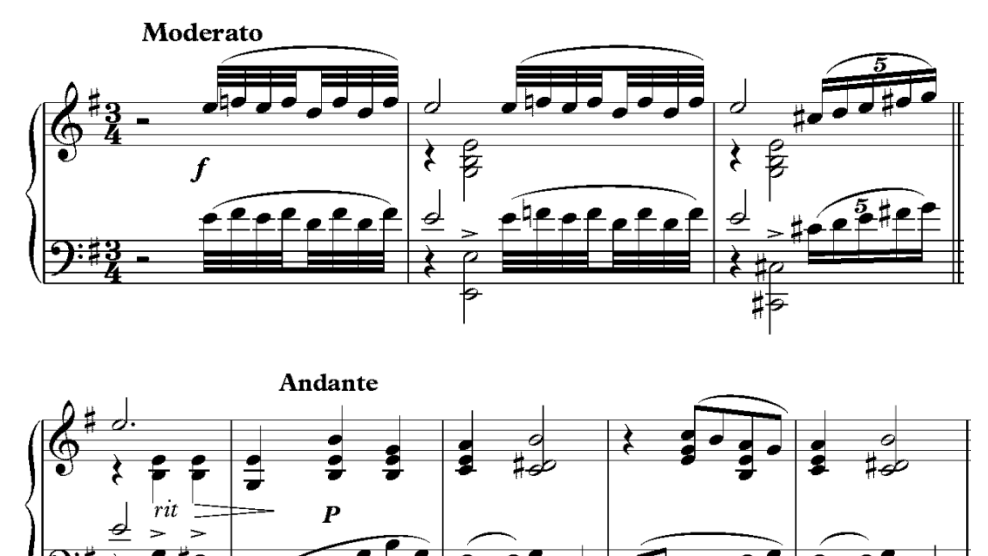
Figure 12. Introduction part with unison sounds in S. Rustamov's ghazal-romance "Deyil"

In section A, the sounds of the solo part in the 1st and 2nd sentences first refer to E shur-shahnaz, and then to H shur. In general, the composer has expanded the periods here. This, depending on the couplets of the ghazal, created the conditions for a unique composer capable of reflecting shades of intonation in a broad and interesting way. When using the 2nd line of the 1st bayt, the culmination is obvious, referring to the step of E shur-shahnaz. The composer used the vowel "A" in the response sentence of the 2nd period and included vocalizations (Figure 13).