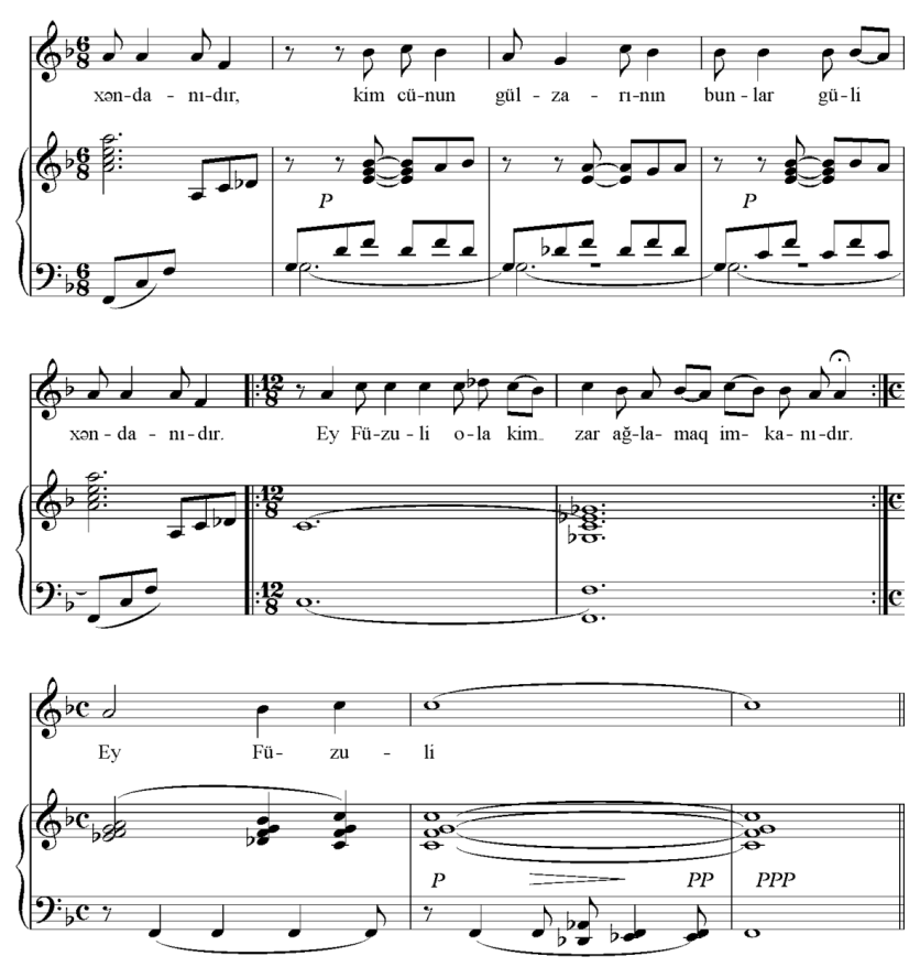
Figure 22. Transition to part A, in R. Mustafayev's ghazal-romance "Malahat sultani"

Composer R. Mustafayev composed the ghazal-romance "Malahat sultani" based on the 5 bayt ghazal of the genius poet M. Fuzuli "Ol parivash". The composer has used all the bayts here. Ghazal in type II of Ramal