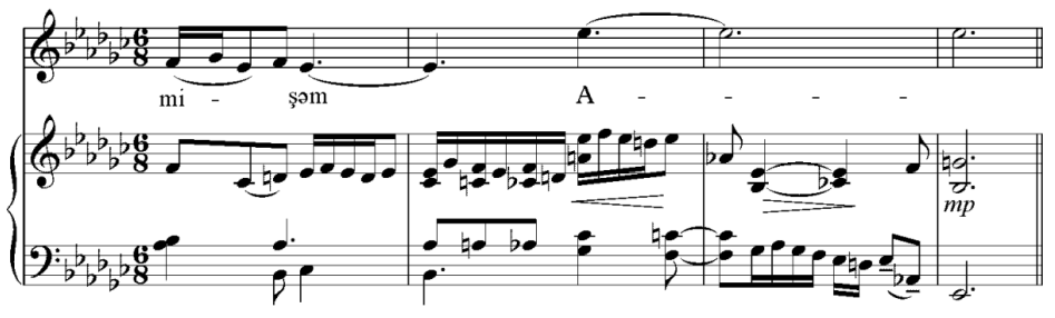
Figure 7. Vocalizations in section A<sub>1</sub>

makham (lad). There are we can see "A" vocalizations also (Figure 7).