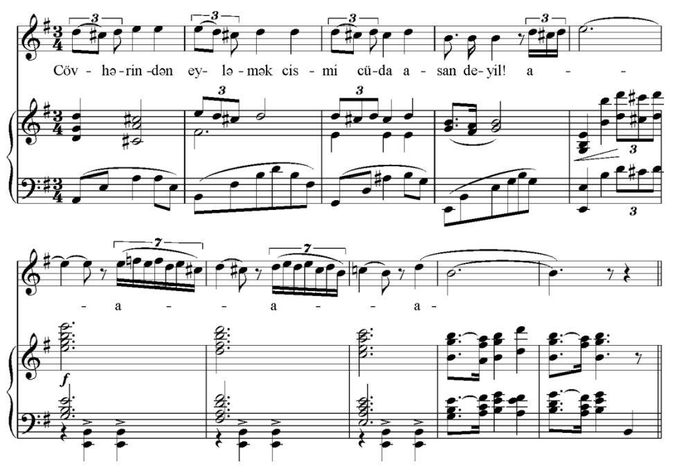
Figure 13. A parts in the ghasal-romance by S.Rustamov "Deyil"

In part B, the composer used the 2nd bayt of the ghazal. In the 1st misra of the 1st bayt, si refers to the shikhesteyi-fars of the shur makham. In the 2nd misra, the shur-shahnaz and shikasteyi-fars steps are used with their