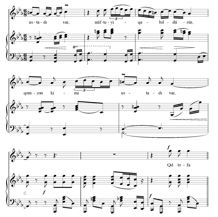
Figure 27. Culmination in part C in A. Abbasov's ghazal-romance "Ey Fuzuli"

the nuance f, in the G shushtar. The sentence endings of this part end in the D tarkib step of the shushtar makham. The question sentence is followed by the culmination in ritenuto in the answer sentence (Figure 27).