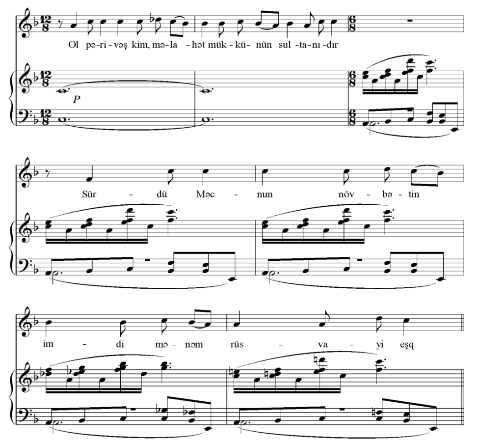
Figure 20. Part A in R. Mustafayev's ghazal-romance "Malahat sultani"

begins with an appeal to the basic tone of A segah and ends with the shikasteyi-fars step. Here there is a jump from the basic tone of la segah to the shakastei-fars step (Figür 20).