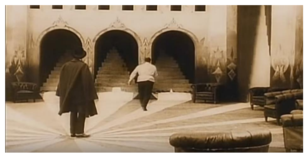
Figure 3: Asylum scene from The Cabinet of Dr. Caligari

Francis says that "[t]he frightful is always in our midst", which refers to distortion of mind resulting in neurotic situation. The film transforms frightfulness and distressed psychology into expressionistic form. Freud asserts that "[n]eurotics turn away from reality because they find it unbearable; the most extreme type of this turning away from reality is shown by certain cases of hallucinatory psychosis which seek to deny the particular event that occasioned the outbreak of their insanity" (1995: 301). Plasticity of brain helps neurons to rewire in order to recover damage however neurotic characters in both films Norman Bates and Francis cannot achieve to overcome traumatic experiences and hallucinations. The films show the line between sanity and insanity and reality is revealed at the end of the films. Norman Bates is shown as a dutiful son however he commits murders due to his dissociative identity disorder. Throughout the film, while Francis is shown as a sane man and is perceived so by the other characters, Dr. Caligari is shown as a mad man. "I won't rest until I get to the bottom of these dreadful deeds" (28:00). Getting to the bottom of these murders and to investigate them are to face his own self and restless mind. He is searching for his own self. Asylum can be resembled to brain and the entrances, exits, rooms and cells are the parts of his distressed mind that he runs in and out (Figure 3).