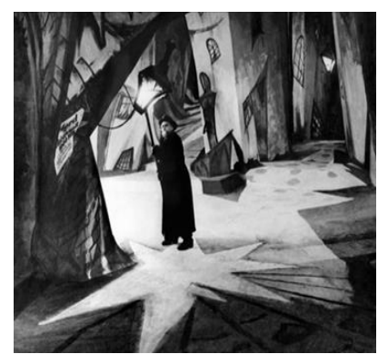
Figure: 2 Scenes from The Cabinet of Dr. Caligari