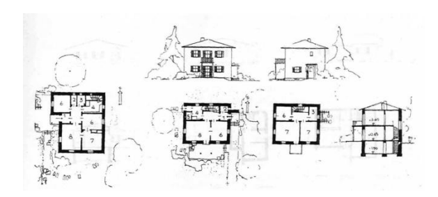
Figure 2.4.Ankara Provinces Cooperative Housing Projects architectural project competition, first prize winner, perspective and plan drawings [11].