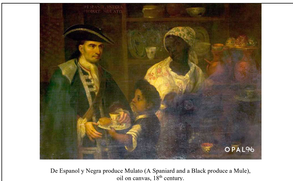
De Espanol y Negra produce Mulato (A Spaniard and a Black produce a Mule), oil on canvas, 18 th century.

The experts who prepared the exhibition project have established that the military uniform in this painting (figure 1) was worn by members of the Spanish Army between 1760 and 1790. As mentioned earlier, clothing, accessories, and other objects in Casta paintings indicate social positioning. Figure 1 shows a group of people in a kitchen-like space. From the woman’s dress and the headdress, she wears, it is thought that she is a maid. The embroidery on her clothes are patterns belonging to the natives of the region.