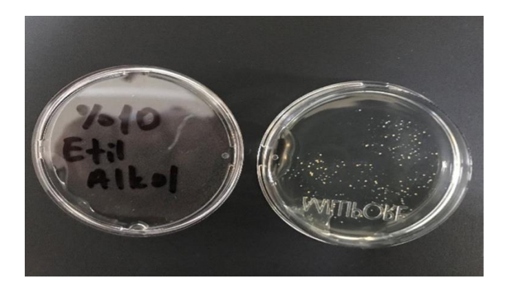
Figure 2: Image of the Petri Dish with 10% Ethyl Alcohol