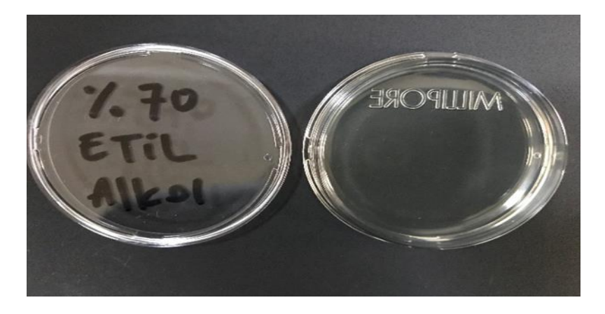
Figure 7: Image of the Petri Dish with 70% Ethyl Alcohol