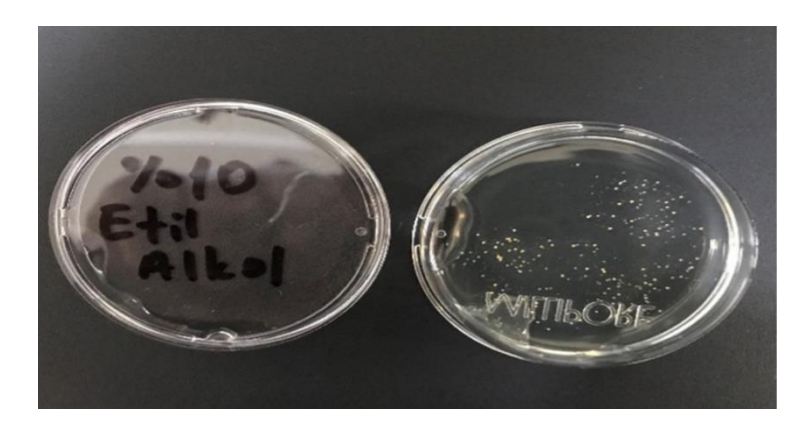
Figure 4: Image of the Petri Dish with 10% Ethyl Alcoho