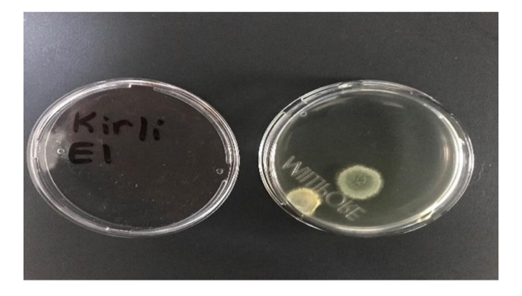
Figure 1: Image of the Petri Dish Labeled as Dirty Hand

Ithe Petri dish (Figure 1, Figure 2), that we called the dirty hand, too many bacteria were growing to count. It was observed that the agar in the Petri dish could not tolerate the growth of the bacterial colonies, so it melted and turned into a liquid. A small section of the bacterial colony was taken and examined under the microscope. The examination revealed a very high number of bacterial formations (Figure 3). A total of 112 colonies were counted in the Petri dish labelled as 10% (Figure 4). A total of 29 colonies were counted in the Petri dish, which was labelled 30% (Figure 5). A total of 14 colonies were counted in the Petri dish labelled 60% (Figure 6). No colony formation was observed in the Petri dishes labelled 70%, 80%, and 96% (Figure 7; Figure 8; Figure 9).