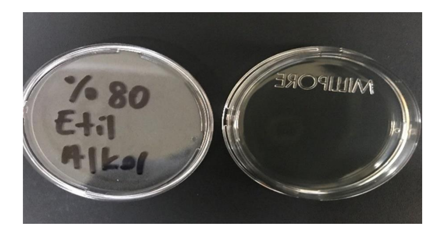
Figure 8: Image of the Petri Dish with 80% Ethyl Alcohol