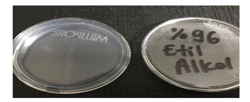
Figure 9: Image of the Petri Dish with 96% Ethyl Alcohol

As can be seen in Table 1, a reduction of about 74% was observed in the bacterial colonies between 10% ethyl alcohol and 30% ethyl alcohol. Between 30% ethyl alcohol and 60% ethyl alcohol, a reduction in bacterial colonies of approximately 51% was observed. As can be seen from the table, the number of colonies detected decreased with increasing ethyl alcohol concentration and finally disappeared at 70% ethyl alcohol.