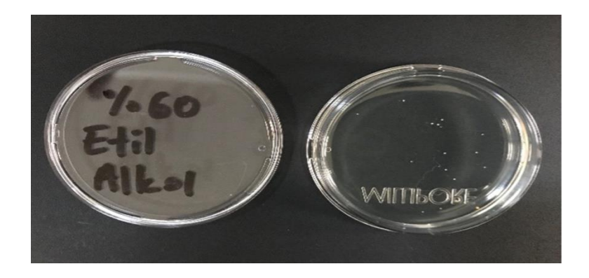
Figure 6: Image of the Petri Dish with 60% Ethyl Alcohol