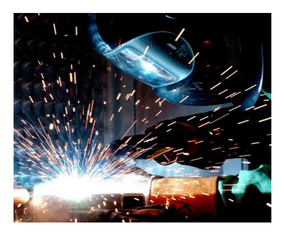
Figure 1. Welding process in the service area.

to be heated until the melting temperature of welding location. Heat sources used in welding technology depend on practices such as electric arc, electric resistance heat, frictional heat, oxy-acetylene flame, or electron beam (5). Power is the rate of conversion of energy from one to another. When welding arc given, almost all of the electrical energy is converted into heat. Only small parts of the heat emitted by the arc diffuse as bright infrared and ultraviolet rays (6).