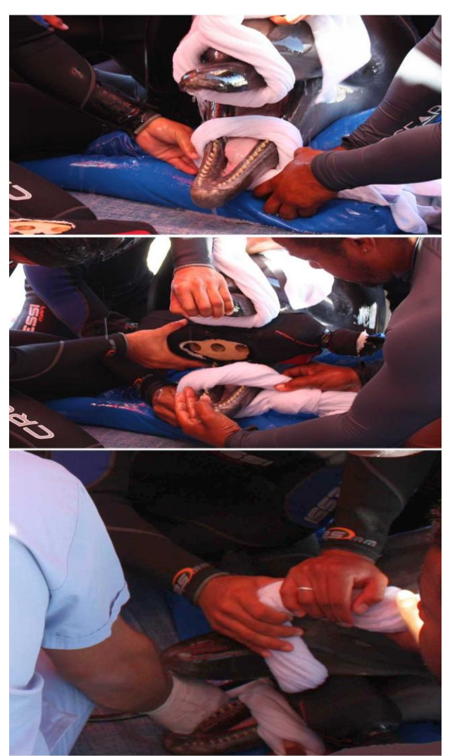
Figure 1: Gastroscopic procedure.Placing the endoscope.

The case material presented was formed by an adult (18 yo) male bottlenose dolphin ( Tursiops truncatus gilli ) weighing nearly 250 kg with a length slightly over 2.95 meters. It was reported in the anamnesis information that a professional diving mask was likely swallowed by the dolphin several weeks ago. In our clinical examination, no clinical findings such as abnormal activity, uneasiness, lethargy, loss of appetite, weight loss, regurgitation, vomiting, etc. were identified.