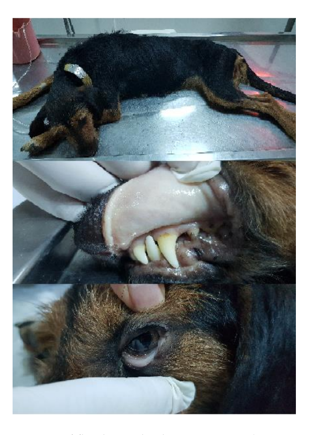
Figure 1: The dog and pale mucous membranes.

Clinical examination revealed decreased body temperature (37.0 °C), weight loss, subicteric and pale mucosal membranes, and weakness (Figure 1).