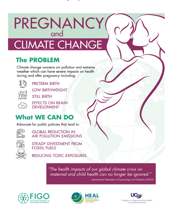
Figure 2 . Infographic for health advocates and policymakers, giving an overview of the ways in which climate change increases health risks to pregnant women and their children

In addition to direct impacts on populations following events such as climate change, disasters and migration, weather conditions also have short- and long-term impacts on human health. Research has shown that disasters and weather events cause major disruptions in the health system and affect health outcomes. Gynecologic cancer patients in need of basic services are the most vulnerable group to extreme weather events.<sup>12,13</sup>