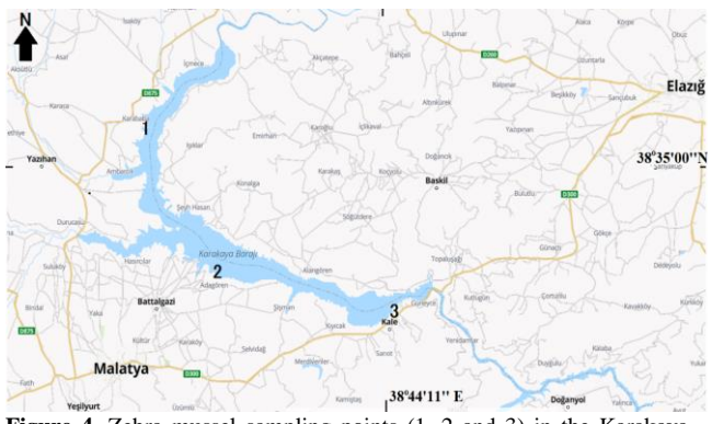
Figure 4. Zebra mussel sampling points (1, 2 and 3) in the Karakaya reservoir.

Karakaya reservoir is located in Malatya province, between longitudes 38^{\circ} 30' East and 40^{\circ}21' East and latitudes 38^{\circ} 17' North and 39^{\circ} 11' North (Figure 2). The reservoir was a lake with a size of 268 km<sup>2</sup> and an elevation of 670 to 920 meters above sea level. The maximum depth of the reservoir is 36 m, and the average temperature ranges between 7 °C and 29.7 °C (Ayekin et al., 2018). The sampling points (1, 2 and 3) of zebra mussels from Karakaya reservoir are shown in Figure 4: 1 (38° 38'19" N, 38° 20' 49" E), 2 (38° 27' 11" N; 38° 27' 42"E) and 3 (38°24'47" N; 38°45'08" E).