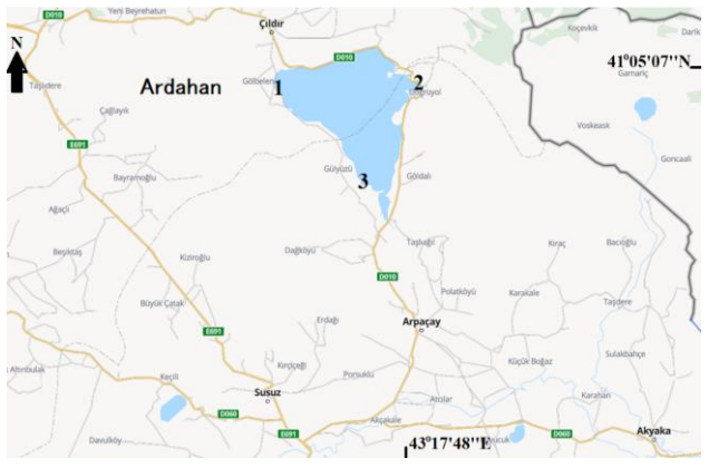
Figure 3. Zebra mussel sampling points (1, 2 and 3) in Çıldır Lake.

sampled from three locations in Çıldır Lake, Karakaya, and Keban reservoirs. Care was taken to have at least 50 zebra mussels in each sampling. Çıldır Lake is at 41°03' 23" N and 43°14'39" E coordinates and is 1900 m above sea level. The lake's average temperature varies between -8 °C and 6 °C (Anonymous 2023; Bağcı et al., 2023). The sampling points (1, 2, and 3) of the zebra mussel in Çıldır Lake are shown in Figure 3: 1 (41° 03' 54" N; 43° 08' 25" E), 2 (41° 03' 58" N; 43° 19' 12" E), and 3 (40° 58' 30" N; 43° 15' 12" E).