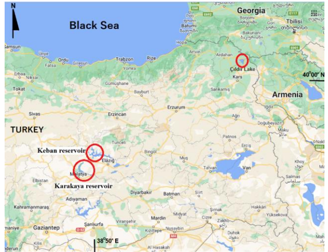
Figure 2. Çıldır Lake, Karakaya and Keban reservoirs.

Zebra mussels ( Dreissena polymorpha ) collected from Çıldır Lake, Keban and Karakaya reservoirs were used in the study (Figure 2). Zebra mussels were sampled from Çıldır Lake in August 2019, Keban in August 2021 and Karakaya Reservoir in September 2021. Zebra mussel sampling could not be carried out in other months of the year due to transport difficulties, health problems and COVID-19 pandemic restrictions. Zebra mussels were