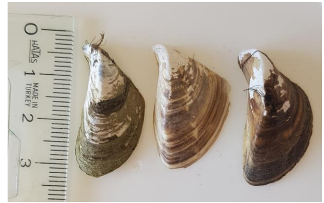
Figure 1. Dreissena polymorpha.

The study utilized zebra mussels ( Dreissena polymorpha ) collected from Çıldır Lake, Keban, and Karakaya reservoirs (Figure 1 and 2).