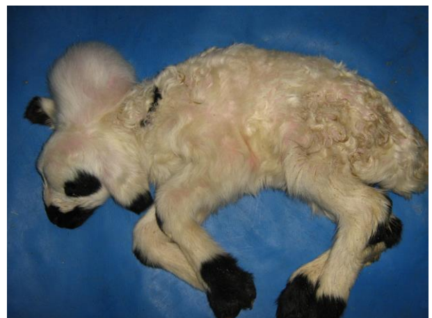
Figure 6: Meningocele in lamb.