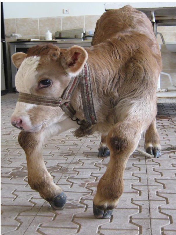
Figure 3: Flexural deformity of the forelimbs in a Simmental calf.