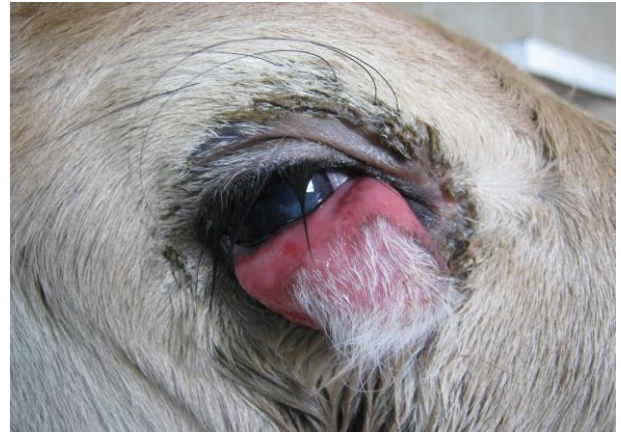
Figure 4: Dermoid cyst in the right eye of a Simmental calf.