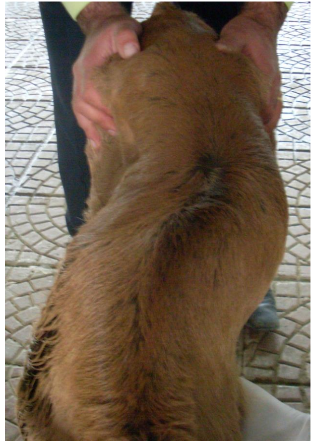
Figure 5: Scoliosis in Brown Swiss calf.