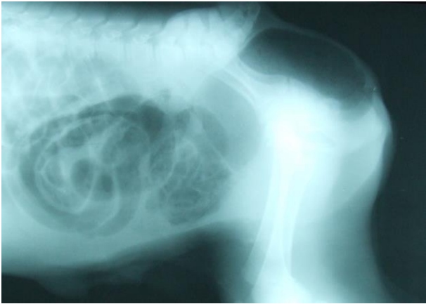
Figure 1: Radiographic view of a calf with atresia ani and coccygeal agenesis.