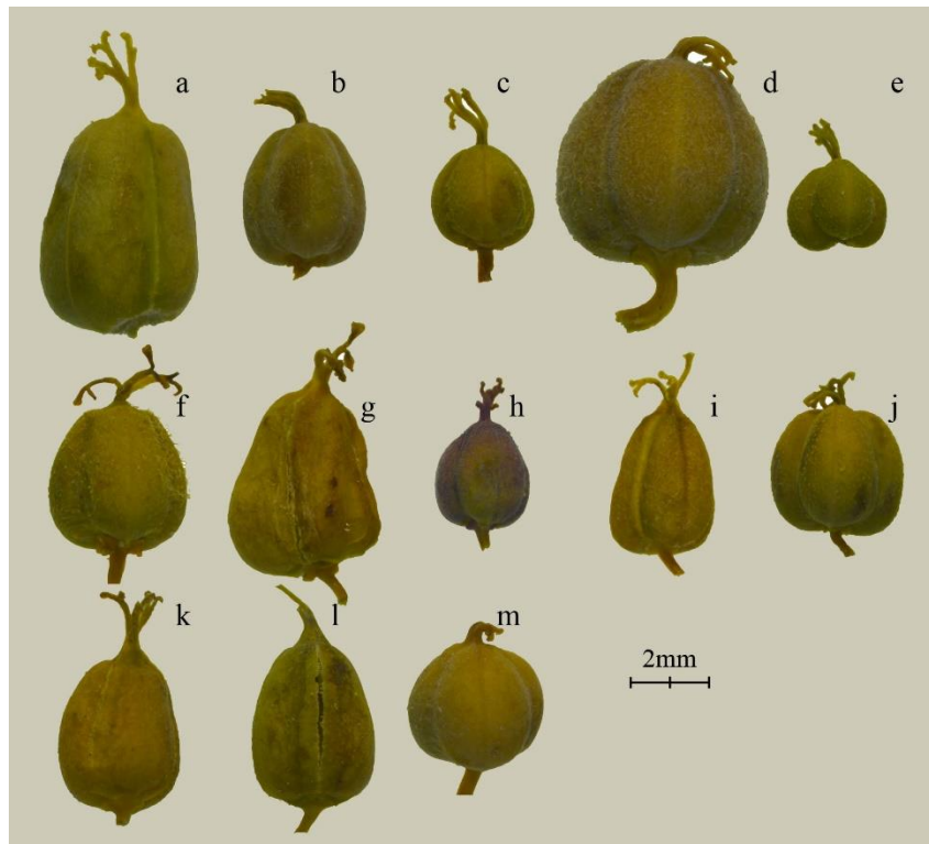
Fig. 2. Stereomicroscopic micrographs of capsules of studied taxa: a. E. cheiradenia , b. E. erythron , c. E. glareosa , d. E. macroclada , e. E. niciciana , f. E. pannonica , g. E. pestalozzae , h. E. petrophila , i. E. pisidica , j. E. seguierana , k. E. smirmovii , l. E. thessala , m. E. yildirimlii .