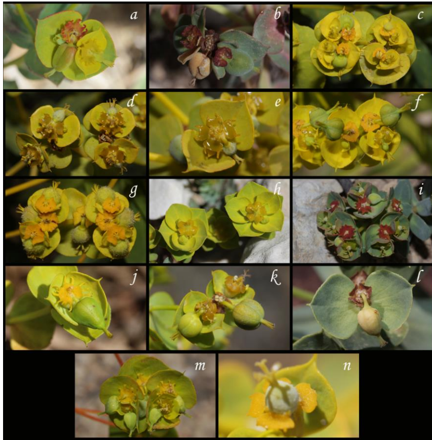
Fig. 1. Photographs of cyathial glands of studied taxa: a. E. cheiradenia , b. E. erythron , c. E. glareosa , d. & e. E. macroclada , f. E. niciciana , g. E. pannonica , h. E. pestalozzae , i. E. petrophila , j. E. pisidica , k. E. seguierana , l. E. smirmovii , m. E. thessala , n. E. yildirimlii .