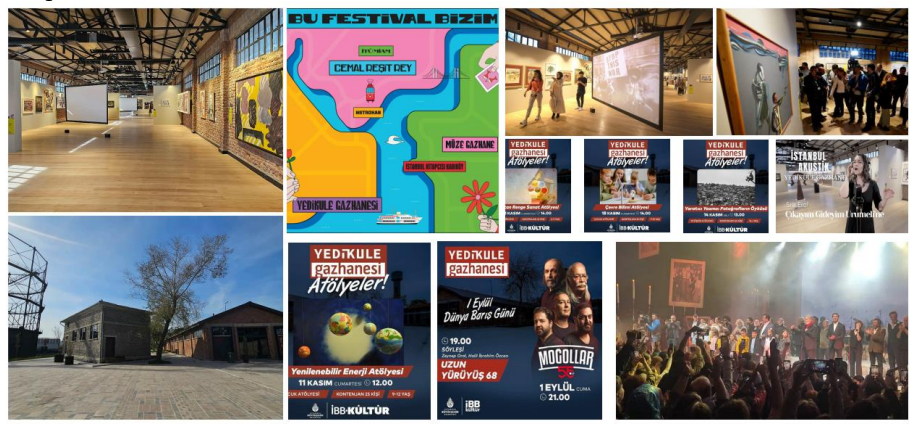
Figure 5. Photos from Yedikule Gasworks after conservation processes that began in 2019, and posters of the events held in this area (IBB Kültür, 2023; Istanbul Metropolitan Municipality, 2023).